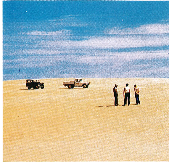
DESERT—NAMBUNG NATIONAL PARK

In appropriate areas, horse riding and quiet forms of boating also facilitate enjoyment of the natural values.