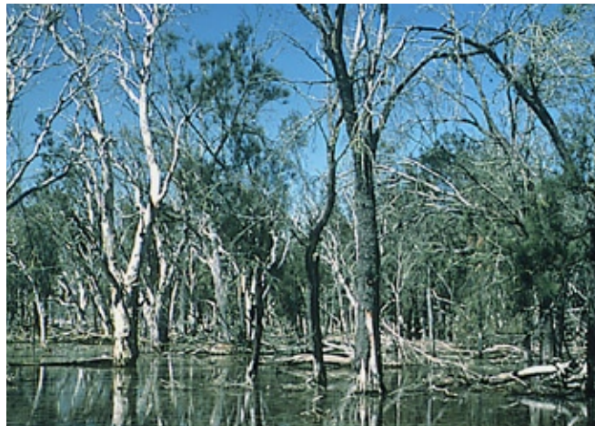
Salinity threatens survival of many native plant communities.

for the establishment of seed orchards from which further seed collections can be sourced, thereby reducing the pressure on wild populations. Seed and seedlings material can also be used in