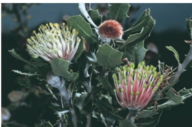
Above: Matchstick banksia (Banksia cuneata). Above right: Mt Lesueur grevillea (Grevillea batrachioides). Both plants have a critically endangered status.

The Seed Notes are available from www.naturebase.net