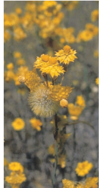
Everlasting daisy seed are dispersed by wind.

There are also many light-weighted fruits and seed that are reliant on the wind for dispersal. Some of our most notorious weeds are dispersed in this way (dandelions, cape weed and some grasses). Other fruits and seed hitch a ride on mammal fur and our woollen socks are also carriers of seed. Next time you walk through the bush, have a look at what seed you are dispersing.