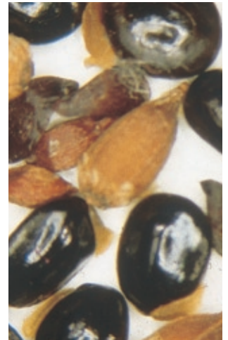
A range of seeds can be used as bush tucker.

Some seeds constitute 'bush tucker' for Indigenous people and some of these are valuable sources of food for the new gourmet food industry. The seeds of some wattles ( Acacia spp.) can be ground and made into bread, infused to make a coffee-like drink or cooked whole as a legume. Some fruits such as the quandong ( Santalum acuminatum ) have a flesh that can be made into jams and pies.