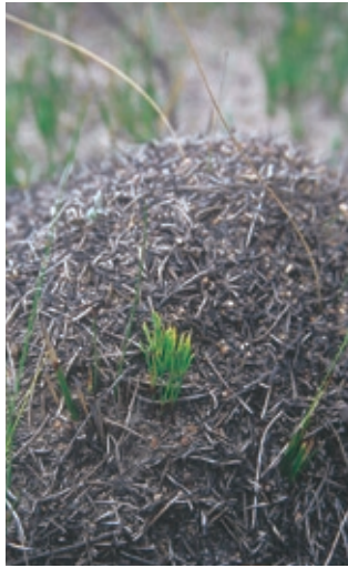
Seedlings germinating in an ant nest.

Once fruits are formed and reach maturity, plants rely on various mechanisms for dispersing them. Animals, wind and water may act as vehicles for dispersal. Australia has many plant species that are dispersed by ants. These species mainly occur in fire-prone environments on infertile soils. Look out for trails of ants dragging seeds to their nest or seedlings emerging from an ant's nest after fire.