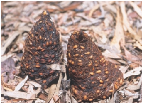
Seed lodged within emu dung.

Many birds and mammals eat the fleshy fruits of plants and take these to new places before the seed are released in their droppings. This natural process is thought to help with germination of the seed in its new home. Next time you are out in the bush have a look for signs of emus and see if you can identify the fruits they have been eating.