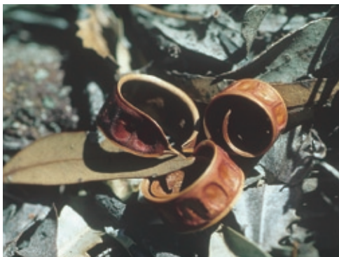
Recently burst open Acacia pod.