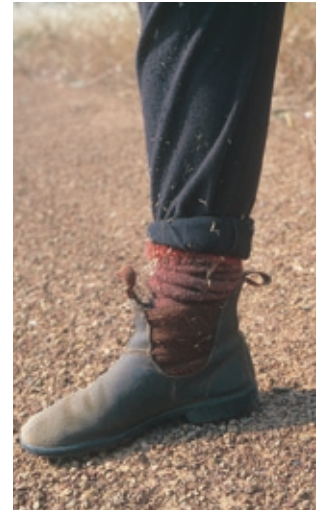
Weed seed going for a free ride.

Many birds and mammals eat the fleshy fruits of plants and take these to new places before the seed are released in their droppings. This natural process is thought to help with germination of the seed in its new home. Next time you are out in the bush have a look for signs of emus and see if you can identify the fruits they have been eating.