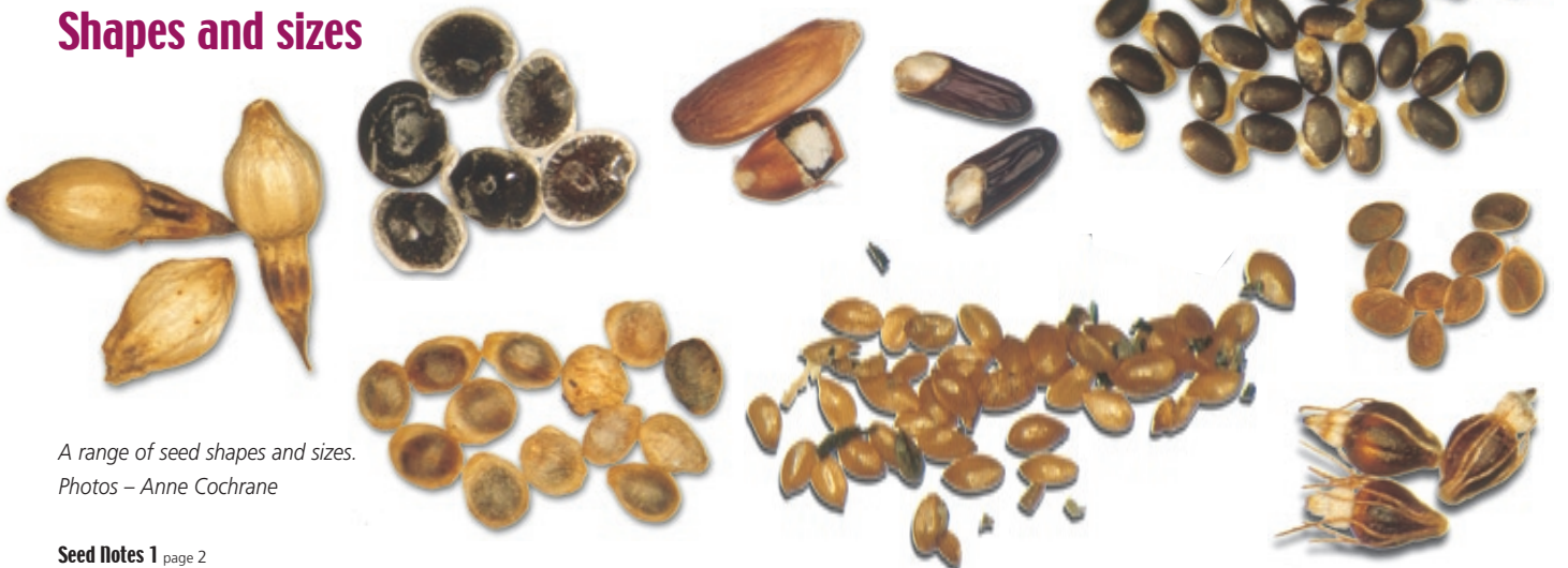
A range of seed shapes and sizes.