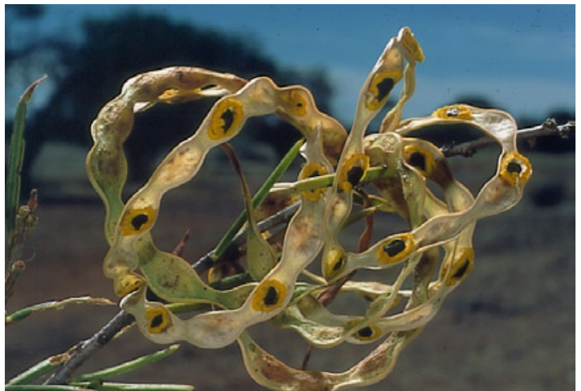
Seed pods of Acacia tetragonophylla . Photo – Babs and Bert Wells/DEC