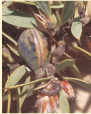
The woody-fruited Hakea aculeata , well protected from fire.

You may have wondered why some seeds have large woody protective outer coatings or fruit? In the Mediterranean environment of the south-west of Western Australia, hard woody fruits can be an adaptive response to frequent fires. Many plants invest considerable resources (especially in relation to time) in developing these protective coverings and the size of the outer fruit is often very large in relation to the small seed held within the fruit. Fruits from the genus Banksia or the woody pear, Xylomelum , have thick woody cones or follicles that protect the seed from fire and may take up to a year to mature. Many of these plants only release their seed from their fruit after fire. Other woody-fruited plants that often release their seed after fire include Hakea and Dryandra . A number of genera are known as fire weeds and regenerate profusely after fire. Their seeds are generally very hard coated and crack from the heat of the fire, enabling them to take up moisture and germinate. Many of the peas fall into this category, as well as the acacias.