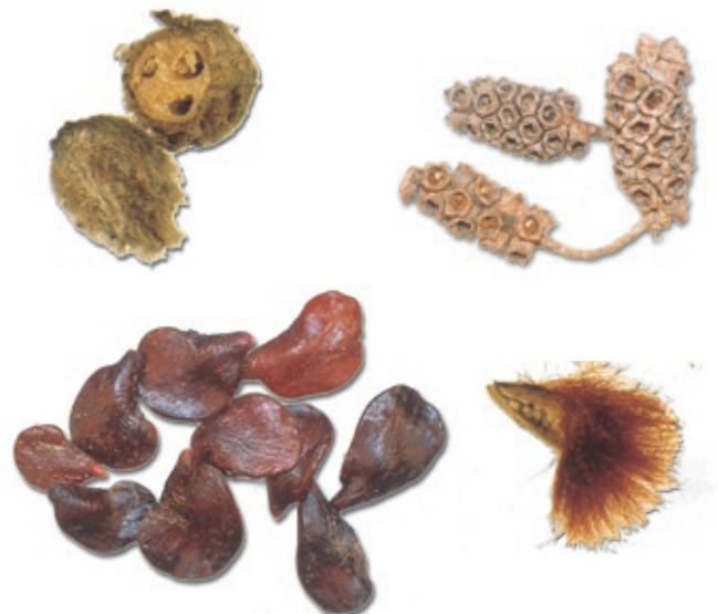
A range of fruit shapes and sizes.

quickly as they are reliant on germinating, flowering and fruiting within one year before they die. These annuals are unlikely to have very large or very woody fruits. And some perennial plants produce very few, if any, fruits and may be reliant on resprouting for regeneration, rather than on seeding.