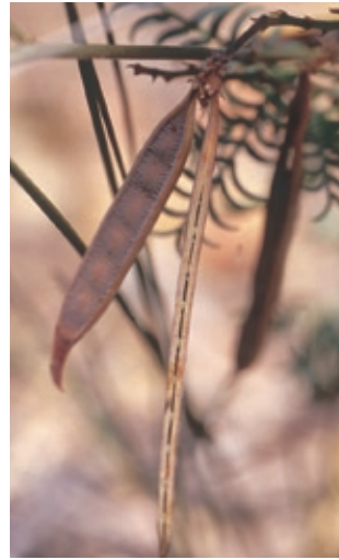
Acacia pods can explode on hot days, dispersing seed.