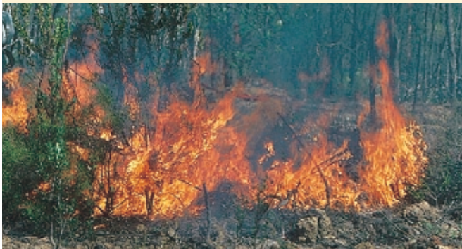
Fire may cause seed from plants, such as peas, to regenerate.