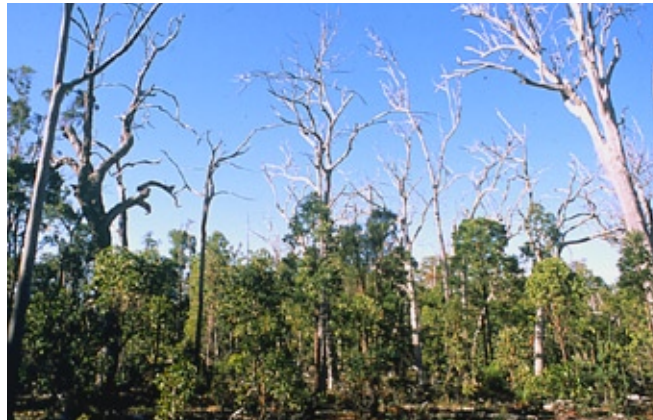
Dieback disease is a major threat to many native species in the south-west of Western Australia.

The conservation of seed is very important as a means of protecting our natural heritage. Loss of biological diversity is perhaps the most serious environmental problem facing Western Australia. Much of our flora in the species-rich heathlands and on the coastal plains is considered susceptible to the dieback disease Phytophthora cinnamomi . In the wheatbelt, dryland salinity poses an additional and almost insurmountable threat. Weed invasion, habitat fragmentation through past and continued clearing of native vegetation, mining and inappropriate fire regimes also threaten the integrity of our plant communities. Collections of seed stored for the short to long term helps prevent the extinction of native plant species. A variety of seed species can be used for bushland regeneration or restoration of degraded landscapes. Seed of individual species can be used in reintroduction and recovery into managed environments when required. This is of vital importance to the maintenance of genetic diversity. Seed can be used