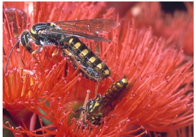
Wasp pollinating Eucalyptus ficifolia .