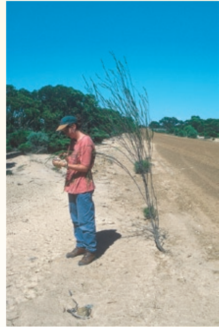
Collecting seed of Eremophila lactea north of Esperance, Western Australia.

The fruit of the Eremophila is generally hard, dry and indehiscent (do not split open to release seed), sometimes fleshy. Fruits turn brown when ripe. Many species have a papery skin around the fruits that will rub off in the fingers. Seed collection of Eremophila is relatively easy. Fruits can be collected from the plant when ripe or from the ground below the plant after fruit has fallen. Many Eremophila species flower in spring to summer. Fruit develops over a few months and generally is ripe by late summer or early autumn. Unless you particularly require fresh seed, collecting can occur at most times of the year.