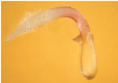
Right: Eremophila longifolia .

Alternatively, the wetting and drying cycle over the seasons and a certain amount of abrasion from soil movement will eventually break down the hard fruit coat and stimulate germination. This may take several years depending on how old the fruits are. Older fruits collected from beneath adult plants will germinate faster, although check that predation of the fruits has not occurred. To speed up the germination process fruits can be split with a knife or scalpel and seeds exposed undamaged to a growing medium. Care should be taken not to damage the seed, as damaged seeds are unlikely to germinate. Put the extracted seed on a sterile medium (for example agar, vermiculite or filter paper). The addition of Gibberellic Acid (as GA 3 at 25mg L) will help germination. Germination of up to 100 per cent should be achieved for many species under these conditions. It has been suggested that seed viability is reduced over time, but there have been instances where seed has germinated many years after collection. Chances are that in cases of documented poor germination, the fruits are empty or predated and therefore not viable. Fruits containing good seed will maintain their viability for many years if stored dry and under cool conditions.