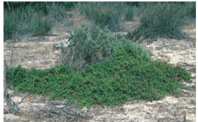
The rare prostrate Eremophila subterrefolia .