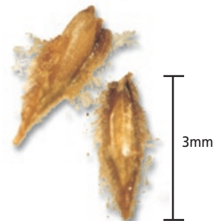
Eremophila lactea have relatively soft fruits easily split open to reveal seed.