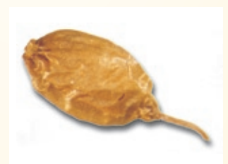
Eremophila resinosa fruit.