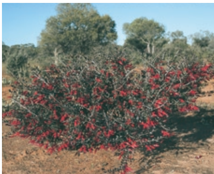
Eremophila maculata .

Many species flower on and off throughout the year, with peak flowering during spring. A large number of Eremophila species are insect pollinated, with beetles, flies and possibly bees implicated as pollinators. The flowers of most species are also well adapted for bird pollination with honeyeaters and bees feeding on nectar. Mammal pollination and nectar feeding on flowers has also been reported. Eremophila are disturbance opportunists and after fire or road maintenance activities can be seen regenerating in the hundreds. Lack of appropriate disturbance may render them temporarily extinct in the standing vegetation until some form of disturbance causes regeneration from the soil seed reserve. A balance between too much and too little disturbance is required for the ongoing survival of many of the threatened species.