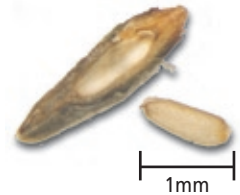
Location and size of seed of Eremophila veneta within the fruit.