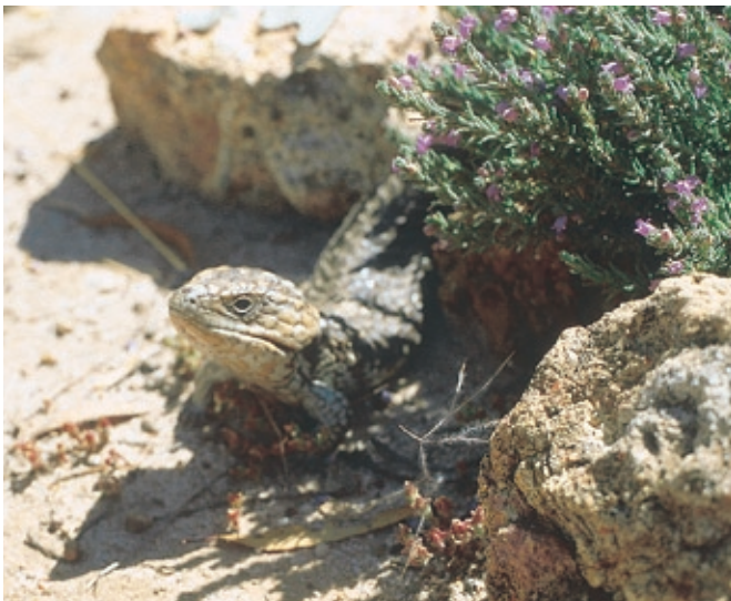
This bobtail lizard stands guard over the rare Eremophila caerulea ssp. merrallii .