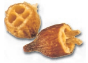
Aborted seed in fruit of Eremophila resinosa .