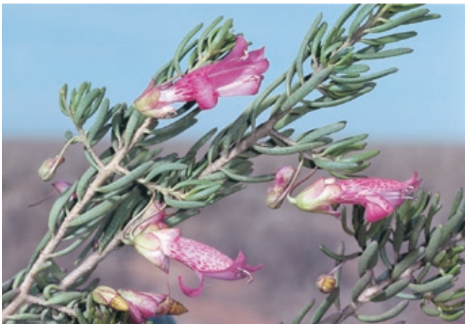
From top: The attractive and colourful flowers of the genus Eremophila .