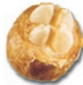
All four of Eremophila resinosa locules filled.