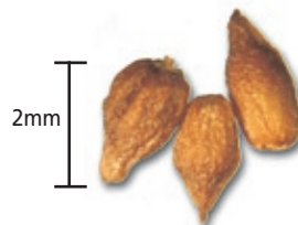
Eremophila sargentii fruits.