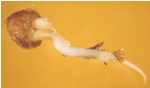
Eremophila seed germinating—(above) from within partially dissected fruit, (below) seed fully extracted from fruit.

Seed germination of Eremophila is considered to be difficult and unreliable, and cuttings are generally used to propagate plants. Delayed germination is a survival strategy for most Eremophila species. The hard woody fruits may contain chemical inhibitors that suppress germination. The hard fruit also resists the penetration of water, gas exchange and root growth until some form of mechanical injury or fire occurs, thereby stimulating germination. If you are not in a hurry, sow fruits on site in the ground and wait for weathering to occur. Or assist the weathering process by burning plant litter on top of pots containing seed.