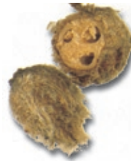
The three loculed fruits of Eremophila caerulea .