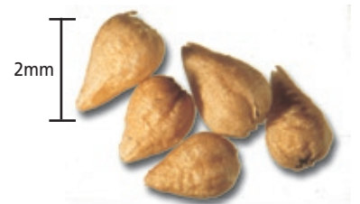
Eremophila microtheca fruits.