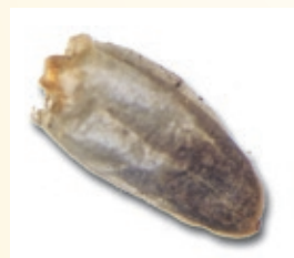
Eremophila veneta fruit.