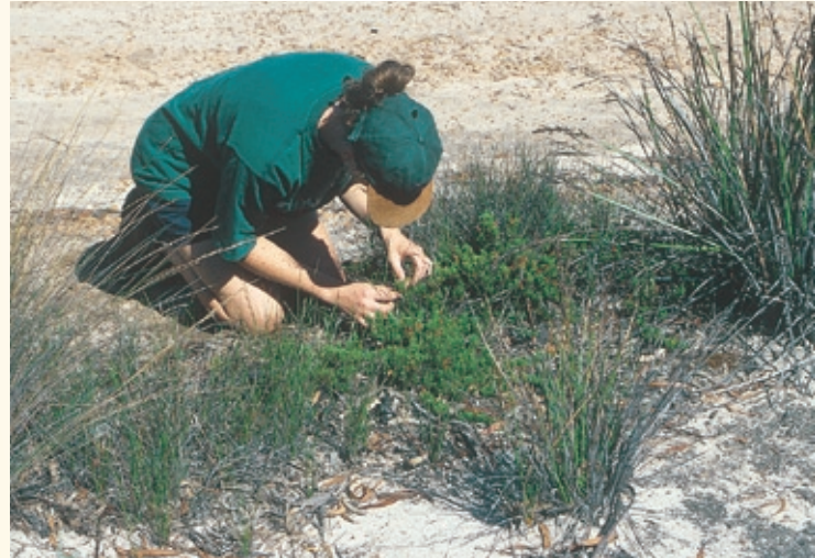
Collecting seed from the rare prostrate Eremophila subteretifolia .