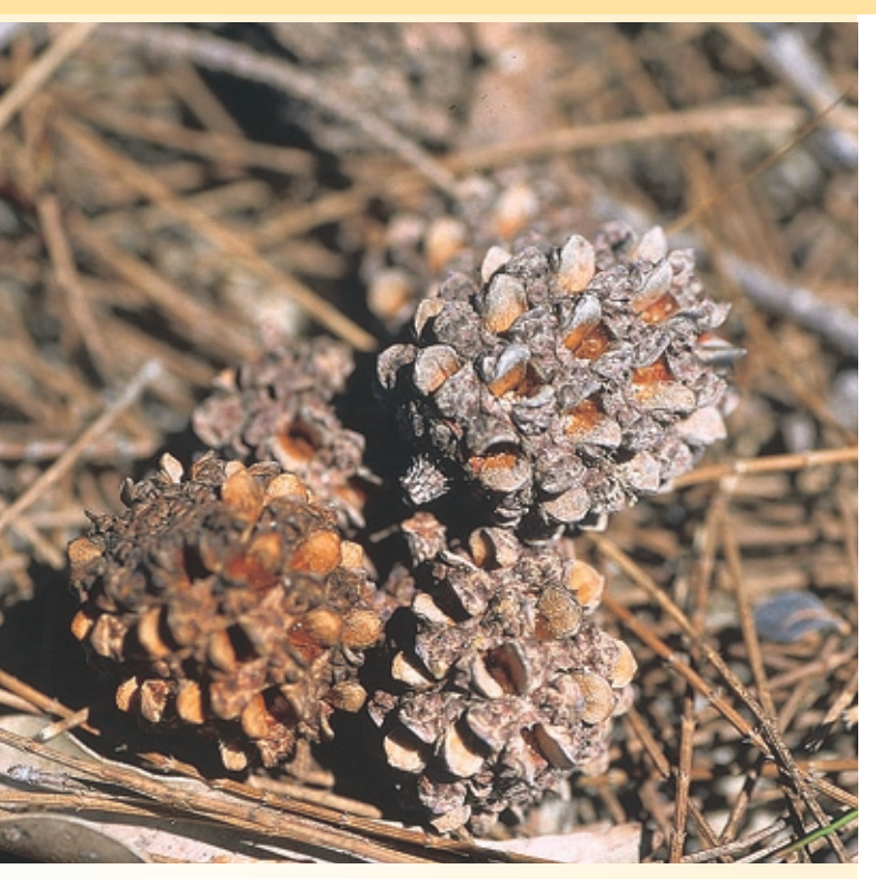
Above: Allocasuarina thuyoides.