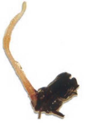
Germinating Allocasuarina ramosissima seed.

Below: Typical fruits of Allocasuarina.