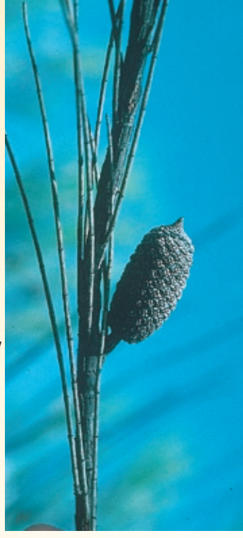
Above: Allocasuarina tessellata.

The fruiting body of Allocasuarina is a woody cone and the fruit itself is a winged nut or samara (dry indehiscent winged fruit). The seed is solitary within each samara and embryonic, meaning there is no food body around the embryo. The cones themselves contain many seeds, and are generally mature within a year of flowering. Flowering can occur from autumn to spring and many species retain their cones for several years, being termed serotinous or canopy stored. Cone collection is easy. Maturity is generally indicated by a change in cone colour from green to pale brown to dark brown. Cones from the previous year can be collected, making sure that the valves of the cones are not open. Cones with open valves are likely to be devoid of seed because it would already have been released. Secateurs should be used when taking cones from the fruiting branches. In some cases pole pruners will be required for the collection of cones due to the height of trees.