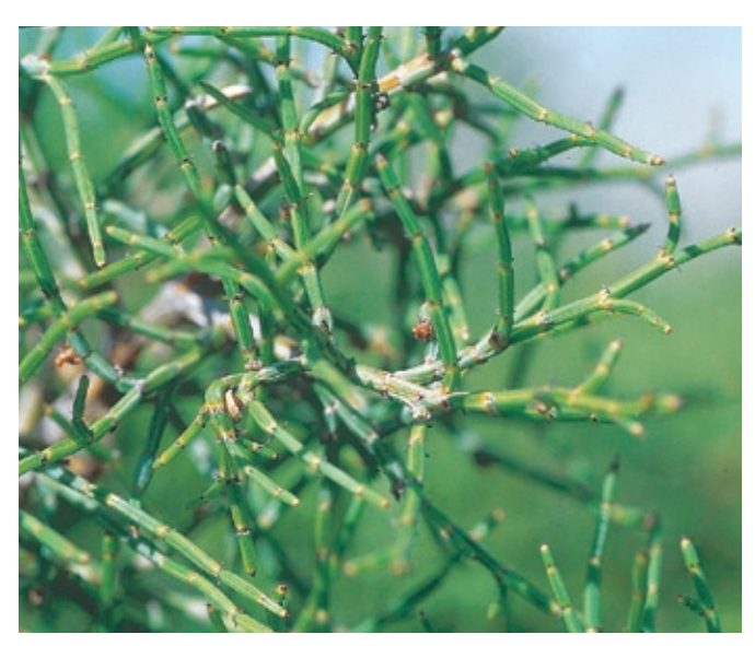
Jointed leaves of Allocasuarina ramosissima.

The name Casuarina comes from the neo-Latin casuarius meaning cassowary, due to the resemblance of the drooping branchlets to the feathers of the Cassowary bird. The Greek allos , meaning other, has been added to the word to refer to the relationship with the genus Casuarina . The common name of 'she oak' was given to the genus in reference to the timber, which is oak-like in appearance.