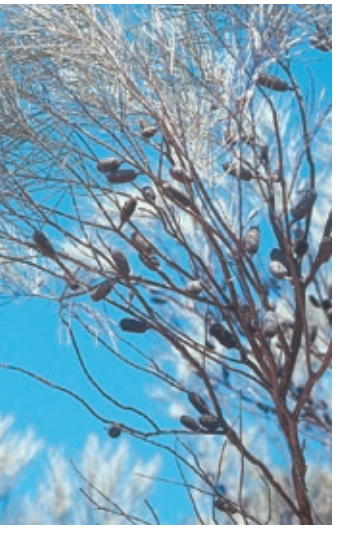
Above: Allocasuarina tessellata.

Allocasuarina are wind pollinated and their seeds are wind dispersed. Because of wind pollination, plants are generally outcrossing, and very little hybridisation occurs within the genus. The roots of the Allocasuarina have nodules that fix atmospheric nitrogen and therefore aid in soil nutrition. Parrots often predate the developing fruits. Cones of Allocasuarina are often found in emu scats and it appears that the old cones help in the digestion of food eaten by these birds. It is not thought that this aids germination of the seed.