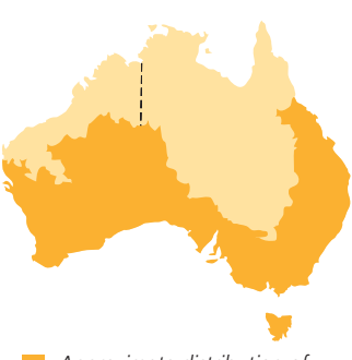
Approximate distribution of Allocasuarina in Australia.

Allocasuarina is a genus endemic to Australia, whereas Casuarina is more widespread. Allocasuarina consists of about 50 species and subspecies that are found mainly in southern Australia. Less than half of these are endemic to Western Australia. Plants usually grow in impoverished soils but can be found in the arid inland, in swamps, on riverbanks and by the coast. They have a preference