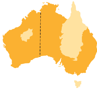
Approximate distribution of Hakea in Australia.

The genus is endemic to Australia and 75 per cent of the species are concentrated in south-western Australia. There are more than 150 known species growing in temperate, semi-arid, arid and sub-tropical zones in habitats that range from forests to tropical hills and desert plains.