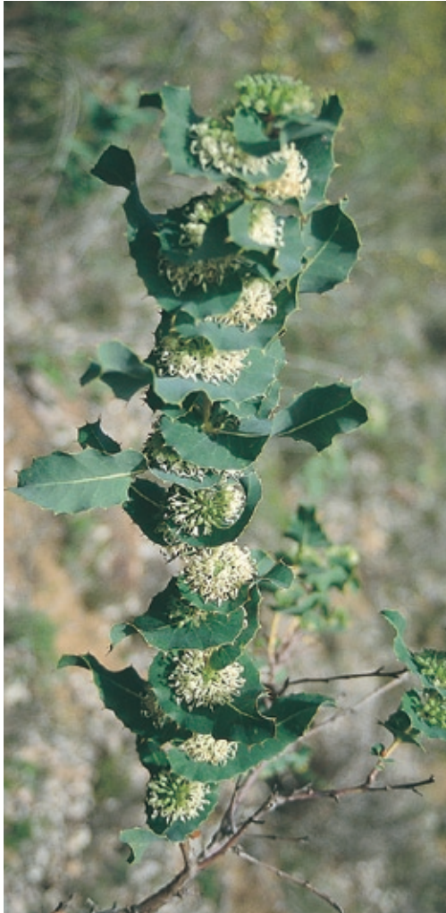
Above: Hakea amplexicaulis . Above right: Hakea lissocarpha .