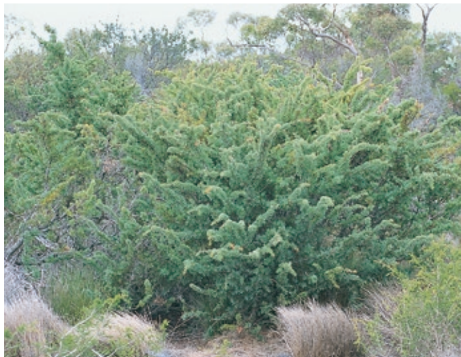
Top: Red flowering Hakea. Above: Hakea lasiocarpa .

woody and persistent; whereas Grevillea has non-woody and non-persistent fruits. Most Hakea species have tough, pungent foliage that may be terete (needle-like), flat or divided into segments. The leaves are generally a similar colour on both sides. Plants are usually single or multi-stemmed shrubs, with smooth bark, although there are 'corkwood' hakeas with thick, deeply furrowed bark. Many Hakea can resprout after fire or disturbance, and these tend to be the species exhibiting multiple stems. The flowers are generally bisexual and range in colour from cream to green to pink, red, orange and mauve. Flowering is mainly in winter and spring with fruits maturing the following summer. Many species are attractive with showy flowers or interesting foliage and several have been used in cultivation for some years. They are generally tolerant of a wide range of soils and climatic conditions.