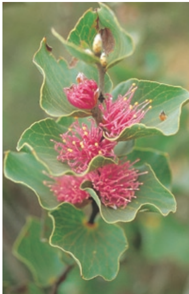
Hakea cucullata . Photo – Sue Patrick

The seed body fits into depressions in the fruit and is often ornately sculptured in some way. There are generally two seeds held within a fruit, although one may be shrivelled or flattened and malformed. Seeds should maintain their viability for many years if stored dry and cool under standard genebank conditions.