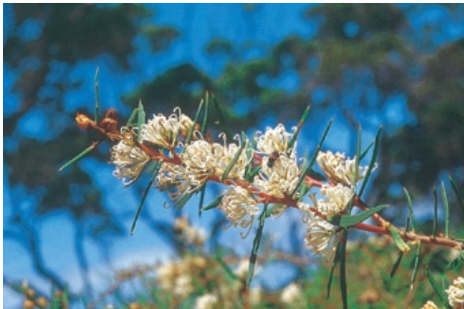
Above: Hakea varia.