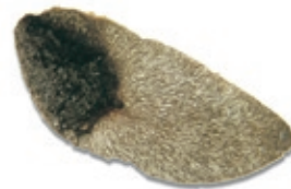
Above: Hakea lasiocarpa .

The seed coat of the Hakea should be dark brown to black when mature with a white solid endosperm. Seed may be predated or shrivelled in the fruit and it is necessary to check for signs of insect damage, such as frass and holes due to grub infestation. Any flattened or shrivelled seed should be discarded as this will not germinate.