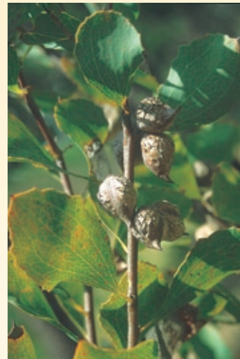
Above: Hakea undulata .

Seed collection of Hakea is easy, although pungent foliage may mean that wearing gloves is required. Some species produce copious quantities of seed whereas the fruit production of others is sparse. Fruits range in colour from grey to brown when ripe, although once matured some may remain greenish in colour. The fruits of many species are hidden within the foliage and may sometimes be difficult to remove from branches. Secateurs must be used to remove fruit and care must be taken not to damage the stems. Seed is usually retained in the woody fruit on the plant for at least one year but fruit will open when the plant dies or after a fire. Some species release seed when the fruit has ripened (e.g. H. ruscifolia and H. prostrata ). Once taken off the plant seed will release from ripe fruits after several days to several weeks under warm dry conditions. Fruits can be kept in a paper bag until they open.