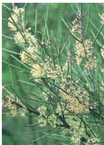
Below right: Hakea oldfieldii .