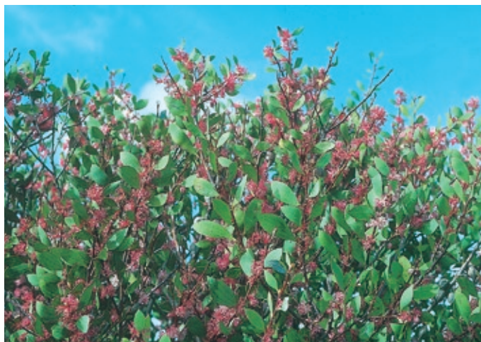
Hakea neurophylla.