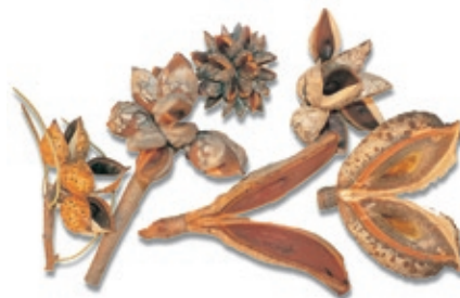
Above: Hakea fruits shapes and sizes.

Hakea are normally propagated from seed but some species can be successfully struck from cuttings. No special treatment is needed for germination of seed and seedlings usually emerge in three to six weeks after sowing. Sow directly into the ground or into pots or dishes for planting out later. It is also possible to germinate Hakea seed on moist filter paper or sponge.