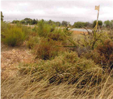
Habitat of punjent jacksonia.

E n d a n g e r e d f l o r a o f W e s t e r n A u s t r a l i a