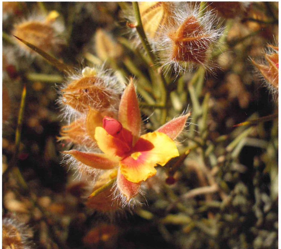
The red and orange flowers of pungent jacksonia.

Pungent jacksonia appears to be a disturbance opportunist and, occurring over a range of 20 to 30 kilometres, is only known from 12 populations. Habitat is on yellow to brown sand