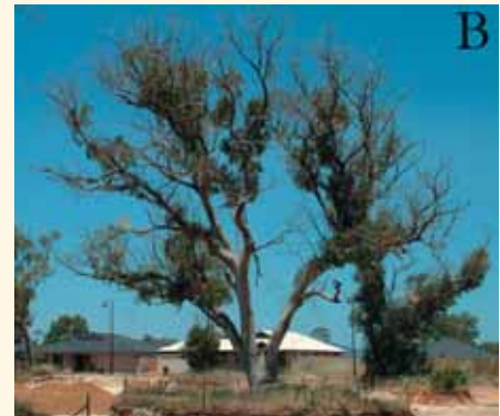
Figure 1: An example of a magnificent, healthy tuart (left) and one with classic decline symptoms.

The values of tuart woodlands include conserving biodiversity, protecting ecosystems functioning, and providing connectivity between remnant vegetation. Tuart woodlands also provide important landscape, cultural, social and economic values.