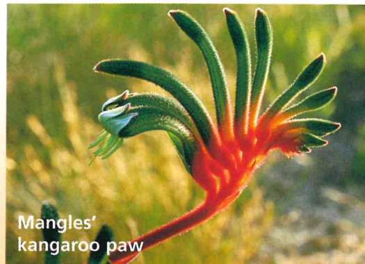
Mangles' kangaroo paw