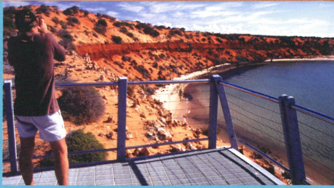
Above Viewing platform at Skipjack Point.