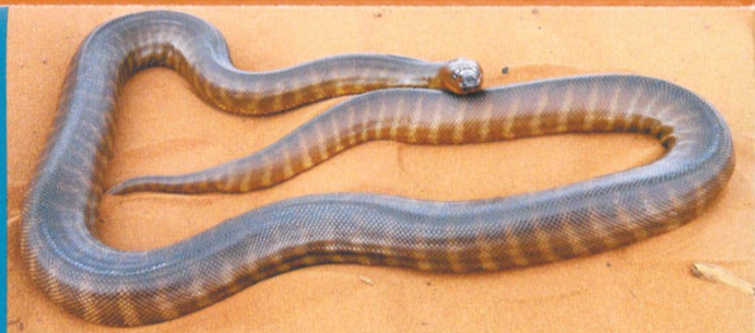
Above Sightings of the woma python have been rare in the past 50 years but the Shark Bay population appears to be increasing.

No drinking water is available in the park. Always carry your own supplies, even on short visits. Allow at least two to three litres per person per day. Drinking water supplies are available in Denham.