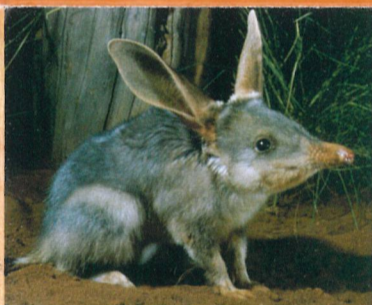
Above A bilby (left) and a malleefowl (right), species that have been successfully established on Peron Peninsula.

The region's birdlife is particularly rich, with diverse land-based, wading and migratory birds all being seen on Péron Peninsula. Emus, fairy-wrens, scrubwrens, finches and wedgebills are the most common species but visitors may also spot the thick-billed grasswren, a threatened species once widespread on the mainland but now restricted to a small area that includes the national park.