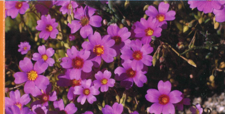
Above The flowering of colourful parakeelyas ( Calandrinia sp.) in spring.

Péron's visit marked the beginning of European activities on Péron Peninsula. In the late 1880s a pearling camp was established at Herald Bight, where pearl shells still litter the beach. The peninsula was managed as a 100,000-hectare sheep station until 1990, when it was bought by the state government. In 1993 François Péron National Park was declared. Today, the Péron heritage precinct offers visitors an insight into what life was like during the pastoral era.