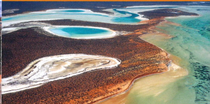
Below Big Lagoon, once a land-locked saline lake, is now a shallow inland bay.