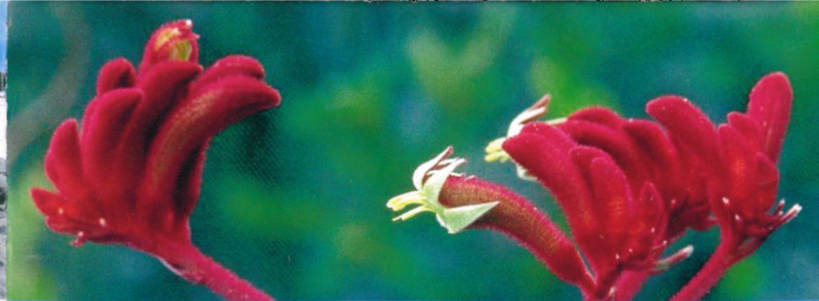
Above Kangaroo paw ( Anigozanthos rufus).