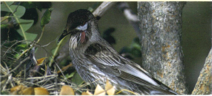
Below Red wattlebird ( Anthochaera carunculata ).

Huge waves and swells can occur suddenly, even on calm days. Rocks become slippery when wet. Riptides are common along the coastline.