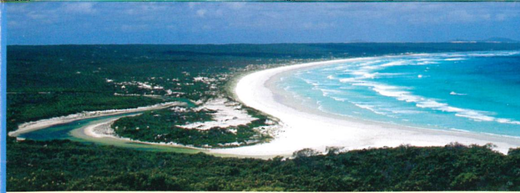
Above Thomas River and Yokinup Bay.

The park's most significant features are Wilson Bluff, a high limestone cliff that provides a vantage point for viewing the spectacular sea cliffs of the Great Australian Bight, and the Delisser Sandhills, which are clearly visible from Eyre Highway.