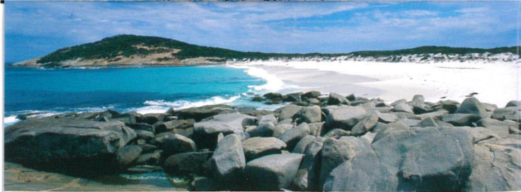
Above Little Tagon Bay, Cape Arid National Park.