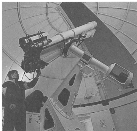
Astrographic Telescope. COVER: 61cm telescope dome.

Perth Observatory is keen to get the public more involved in its activities. One way to directly participate and assist is to join our volunteer program. Current projects involve assisting permanent staff with the public star-viewing sessions, assisting at open days, and preserving historical documents. Those interested should first telephone the Observatory, and then send a written application to the Government Astronomer in August. The applicant should outline why they wish to become part of the program, what skills, qualifications or experience they possess, provide a realistic estimate of time they can contribute, and anything else that they think is relevant.