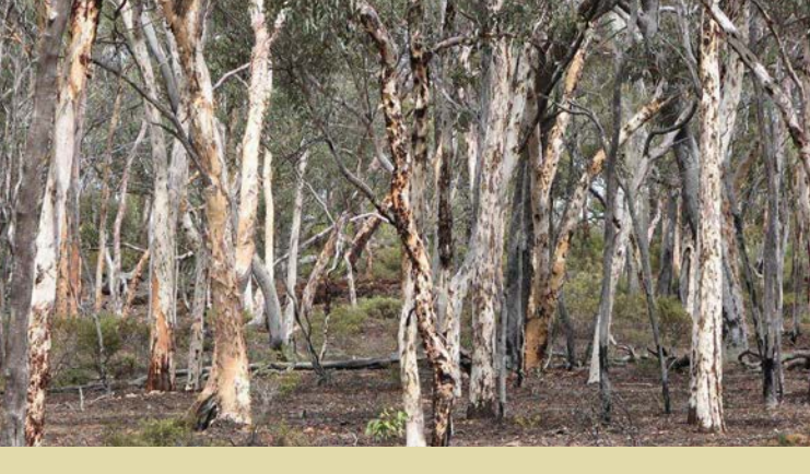
Above Dryandra woodland.