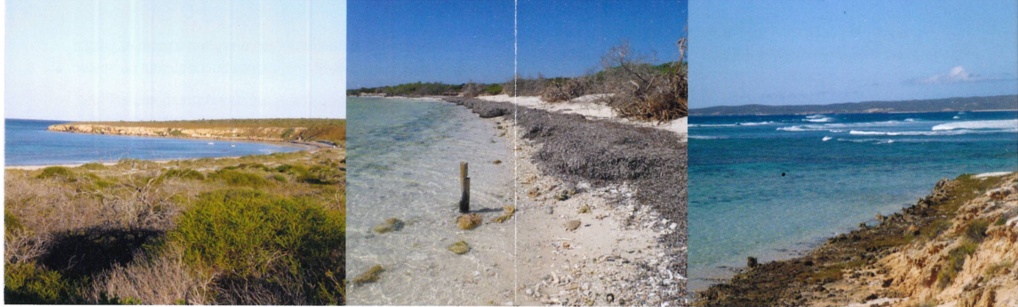
Left Louisa Bay. Centre Whittnell Point. Right Surf Point.