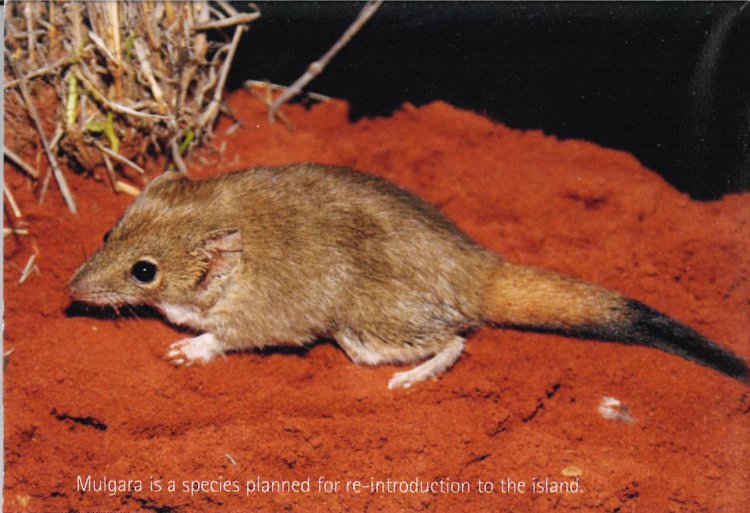
Mulgara is a species planned for re-introduction to the island.