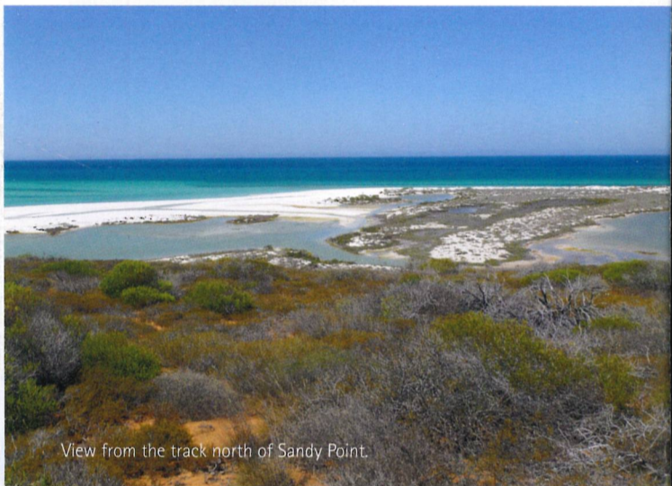
View from the track north of Sandy Point.

Remnants of a tram track used to transport materials for the lighthouse buildings lead to views of Turtle Bay. During summer the beaches below are covered in the tracks of loggerhead turtles that have struggled up the beach through the night to lay their eggs.