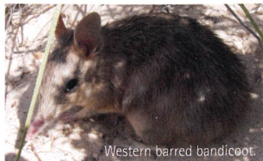
Western barred bandicoot.

The Dirk Hartog Island National Park Ecological Restoration Project, known as Return to 1616 , is returning the island to how Dirk Hartog would have seen it in 1616. Since 2007, more than 10,000 goats and 5000 sheep have been removed and the island's vegetation is showing strong signs of recovery.