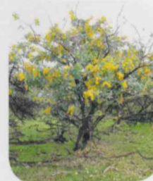
Acacia splendens Dandaragan Wattle

Description: Tree or shrub to 8 m high Flowering: May Rank: EN, EN