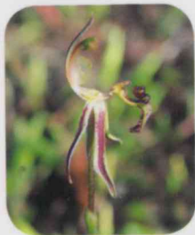
Caladenia drakeoides Hinged Dragon Orchid

Description: Spreading shrub 0.3 to 2 m Flowering: Jun-Jul Rank: CR, EN