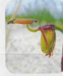
Paracaleana dixonii Sandplain Duck Orchid Description: Orchid to 0.2 m Flowering: Oct-Dec /Jan Rank: VU, EN