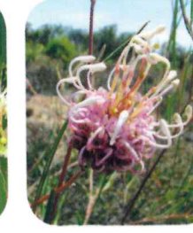
Grevillea bracteosa subsp. howatharra Description: Spreading shrub 0.5 to 2 m high Flowering: Aug-Nov Rank: CR