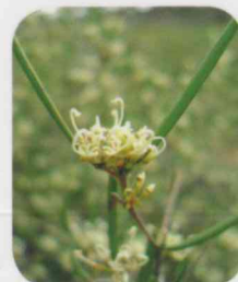
Grevillea christineae Christine's Grevillea

Description: Low shrub 20 to 45 cm high Flowering: Aug-Oct Rank: CR, EN