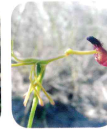
Drakaea concolor Kneeling Hammer Orchid Description: Orchid 25 to 30 cm high Flowering: Aug-Sep Rank: EN, VU