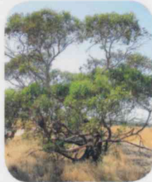
Eucalyptus pruiniramis Midlands Gum Description: Mallee or tree, 2.5 to 7 m high, bark rough & ribbony at base, smooth above Flowering: Dec Rank: EN, EN