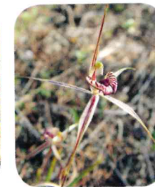
Caladenia wanosa Kalbarri Spider Orchid Description: Orchid 3 to 8 cm high Flowering: Aug-Sep Rank: EN, VU