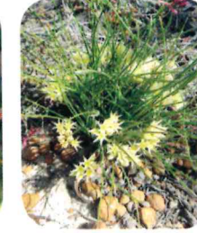
Conostylis dielsii subsp. teres Irwin Conostylis Description: Tufted perennial herb 13 to 33 cm high Flowering: Jul-Aug Rank: VU, EN