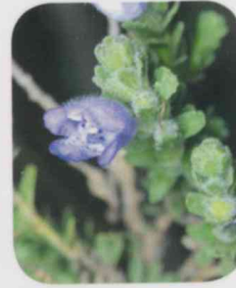
Eremophila koobabbiensis Koobabbie eremophila Description: Erect shrub to 1.5 m high Flowering: Oct-Nov Rank: CR, CR

Description: Low spreading shrub to 1.2 m tall Flowering: Jul-Sep Rank: EN, EN