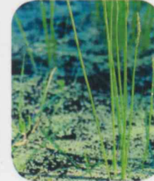
Eleocharis keigheryi Keighery's Eleocharis

Description: Small spreading shrub to 50 cm high Flowering: Jun-Oct Rank: VU, VU