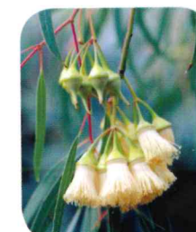
Eucalyptus beardiana Beard's Mallee Description: Mallee 3 to 5 m high, bark smooth Flowering: Aug-Sep Rank: EN, VU