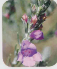
Eremophila microtheca subsp. narrow leaves

Description: Sprawling shrub to 1 m high Flowering: Jul-Nov Rank: CR