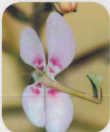
Stylidium amabile Description: Perennial rosetted herb 6 to 23 cm high Flowering: Sep-Oct Rank: CR