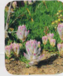
Ptilotus fasciculatus Fitzgerald's Mulla-mulla Description: Mat-forming perennial herb Flowering: Sep-Nov Rank: EN, EN