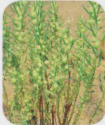
Gyrostemon reticulatus Net-veined Gyrostemon Description: Low shrub to 1 m high Flowering: Jul-Dec Rank: CR, CR