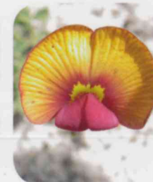
Ptychosema pusillum Dwarf Pea

Description: Herb or shrub to 0.4 m high Flowering: Sept-Dec/Feb-Mar Rank: EN, EN