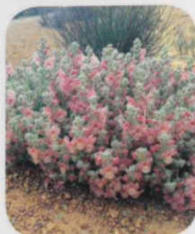
Dasymalla axillaris Description: Small shrub 15 to 30 cm high. Flowering: Aug-Oct Rank: CR, CR