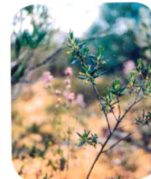
Beyeria lepidopetala Small-petalled Beyeria Description: Open shrub to 0.5 m high Flowering: Jul-Aug Rank: VU, EN