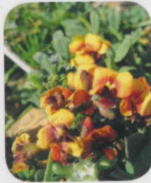
Chorizema humile Prostrate Flame Pea Description: Prostrate ground cover Flowering: Jul-Sep Rank: CR, EN

Description: Orchid to 0.3 m Flowering: Sep-Oct Rank: CR, EN