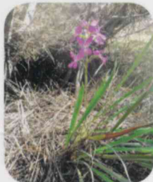
Stylidium wilroyense Description: Tufted perennial herb, 30 to 45 cm high Flowering: Sep-Oct Rank: CR