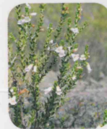
Eremophila vernicosa Resinous Poverty Bush Description: Erect spreading shrub to 50 cm high Flowering: Sept Rank: VU, VU