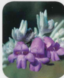
Eremophila nivea Silky Eremophila Description: Soft grey shrub 1 to 2 m high Flowering: Aug-Oct Rank: CR, EN