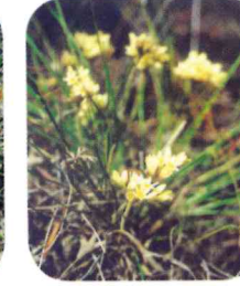
Conostylis micrantha Small Flowered Conostylis Description: Tufted perennial herb 13 to 24 cm high Flowering: Jul-Aug Rank: VU, EN