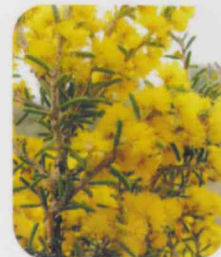
Acacia vassalii Vassal's Wattle

Description: Sprawling glossy shrub to 0.7 m high Flowering: Jun-Jul Rank: CR, EN