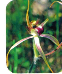
Caladenia hoffmanii Hoffman's Spider Orchid Description: Orchid 13 to 30 cm high Flowering: Aug-Sept Rank: EN, EN