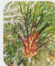
Grevillea calliantha Foote's Grevillea

Description: Mallee to 3 m high Flowering: Feb-Mar Rank: CR, EN