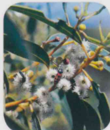
Eucalyptus johnsoniana Johnson's Mallee

Description: Low wiry shrub to 0.5m high Flowering: Nov-May Rank: EN