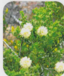
Acacia aristulata Watheroo Wattle

Description: Erect or scrambling shrub to 1 m high Flowering: Sep-Dec Rank: EN, EN