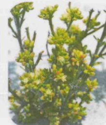
Macarthuria keigheryi Keighery's Macarthuria

Description: Spreading flat-topped shrub 0.9 to 2.5 m high Flowering: Jun-Aug Rank: CR, EN