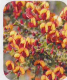
Daviesia dielsii Diels' Daviesia

Description: Semi-prostrate shrub 0.15 to 0.3 m high Flowering: Jun-Jul Rank: CR, EN