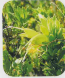
Eremophila glabra subsp. chlorella

Description: Sprawling shrub to 1 m high Flowering: Jul-Nov Rank: CR