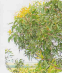
Eucalyptus dolorosa Dandaragan Mallee

Description: Clumped perennial grass-like sedge to 0.4 m high Flowering: Aug-Nov Rank: VU, VU