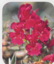
Hemiantra gardneri Red Snakebush

Description: Prostrate to decumbent lignotuberous shrub Flowering: Sep-Nov Rank: CR, EN