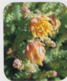
Darwinia chapmaniana Chapman's Bell

Description: Low domed spreading shrub Flowering: Sep-Nov Rank: VU, EN