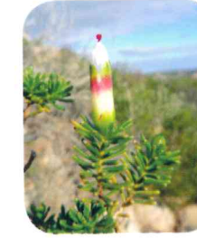
Drummondita ericoides Morseby Range Drummondita Description: Erect shrub 0.3 to 1 m high Flowering: Sep-Oct Rank: VU, EN