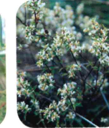
Leucopogon marginatus Thick-margined Leucopogon Description: Erect shrub 0.4 to 1 m high Flowering: Jul-Aug Rank: EN, EN