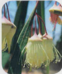
Eucalyptus synandra Jingymia Mallee Description: Mallee 3.5 to 10 m high, bark smooth Flowering: Aug-Mar Rank: VU, VU