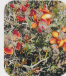
Gastrolobium hamulosum Hook-point Poison

Description: Low shrub 0.15 to 1.5 m high Flowering: Aug-Oct Rank: CR, EN