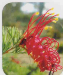
Grevillea humifusa Spreading Grevillea

Description: Upright shrub to 2 m tall Flowering: Oct Rank: CR, EN