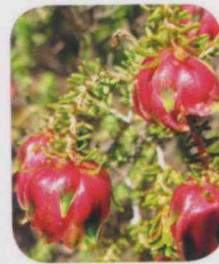
Darwinia polychroma Harlequin Bell

Description: Low domed spreading shrub Flowering: Sep-Nov Rank: VU, EN