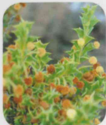
Acacia forrestiana Forrest's Wattle

Description: Erect prickly shrub to 1 m high Flowering: Nov-Dec Rank: VU, VU