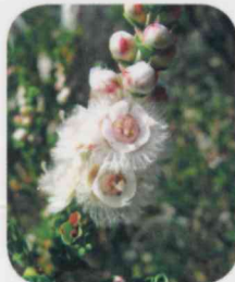
Verticordia albida White Featherflower Description: Upright shrub 0.3 to 3 m high Flowering: Nov-Dec/Jan Rank: CR, EN