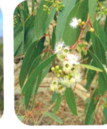
Eucalyptus cuprea Mallee Box Description: Mallee 2.5 to 5 m high, bark rough to 1.5m Flowering: Aug-Nov Rank: CR, EN