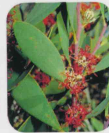
Hakea megalosperma Lesueur Hakea

Split-leaved Grevillea Description: Low shrub to 0.5m high with spreading branches Flowering: Aug-Oct Rank: CR, EN