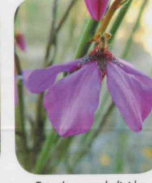
Tetratheca nephelioides Description: Dwarf shrub to 0.3 m high Flowering: Sep Rank: EN, CR