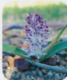
Wurmbea tubulosa Long-flowered Nancy Description: Small annual herb up to 30 cm high Flowering: Jun-Aug Rank: VU, EN