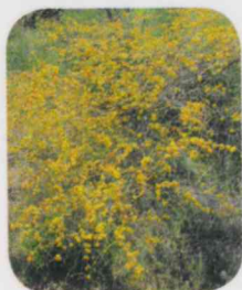
Acacia aprica Blunt Wattle

Description: Spreading shrub 0.3 to 2 m Flowering: Jun-Jul Rank: CR, EN