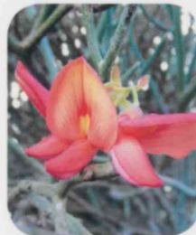
Daviesia speciosa Beautiful Daviesia Description: Many-stemmed shrub to 0.8 m high Flowering: Apr-May Rank: EN, EN