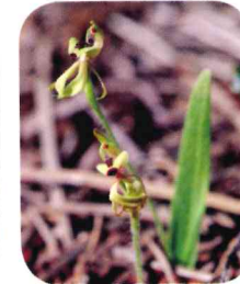
Caladenia bryceana subsp. cracens Northern Dwarf Spider Orchid Description: Orchid to 8 cm Flowering: Aug-Oct Rank: VU, VU