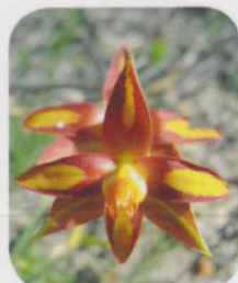
Thelymitra stellata Star Sun Orchid

Description: Prostrate shrub 0.2 m high and up to 1 m wide Flowering: Aug-Oct Rank: CR, EN