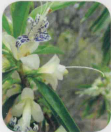
Eremophila viscida Varnish Bush Description: Upright shrub 1.2 to 4 m high Flowering: Sep-Nov Rank: EN, EN