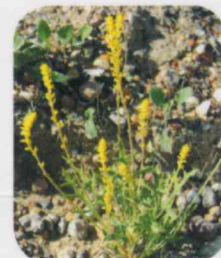
Synaphea quartzitica Quartz-loving Synaphea

Description: Domed grey shrub 0.3 to 1 m high Flowering: Oct-Jan Rank: CR, EN