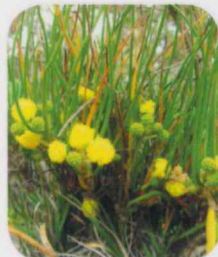
Acacia wilsonii Wilson's wattle

Description: Erect prickly shrub to 1 m high Flowering: Nov-Dec Rank: VU, VU