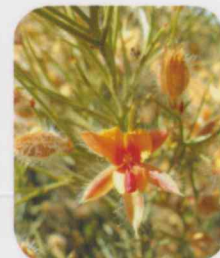
Jacksonia pungens Pungent Jacksonia

Description: Erect wiry shrub to 60 cm high Flowering: Aug-Sep Rank: EN, EN