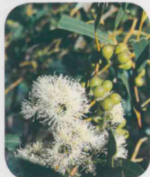
Eucalyptus lateritica Mt Michaud Mallee

Description: Mallee to 3.5 m high, bark flaky to 0.5 m then smooth. Flowering: Various Rank: VU, VU