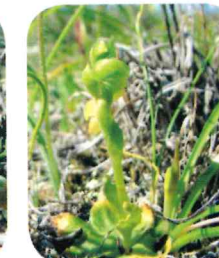
Pterostylis sinuata Northampton Midget Greenhood Description: Orchid 5 to 10 cm high Flowering: Jul-Aug Rank: CR, EN