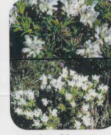
Petrophile nivea Description: Erect rigid shrub to 0.6 m high Flowering: May-Jul Rank: VU