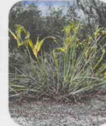
Anigozanthos viridis subsp. terraspectans

Description: Slender erect or open straggly shrub Flowering: Sep-Nov Rank: VU, EN