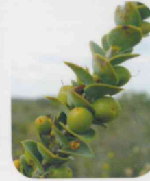
Leucopogon obtectus Description: Erect open shrub to 1.5 m high Flowering: Aug-Oct Rank: EN, EN

Description: Spreading lignotuberous shrub 1 to 2 m high Flowering: May-Jun Rank: VU, VU