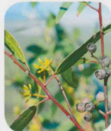
Eucalyptus suberea Cork Mallee

Description: Mallee 2 to 3 m high, bark rough at base Flowering: Aug-Oct Rank: EN, VU