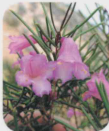
Eremophila rostrata subsp. trifida Southern Beaked Eremophila Description: Upright shrub to 3 m high Flowering: Sep-Oct Rank: CR, CR