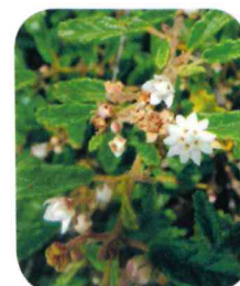
Androcalva bivillosa Strangling Androcalva Description: Low prostrate shrub Flowering: Aug-Nov Rank: VU, VU