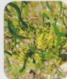
Acacia cochlocarpa subsp. cochlocarpa Spiral-fruited Wattle

Description: Erect or scrambling shrub to 1 m high Flowering: Sep-Dec Rank: EN, EN