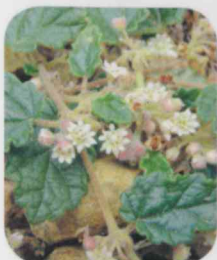
Androcalva adenothallia Description: Low prostrate shrub Flowering: Aug Rank: CR