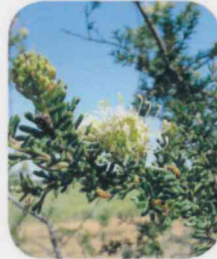
Grevillea murex Shell-fruited Grevillea Description: Spreading shrub 1 to 2.5 m high Flowering: Aug-Oct Rank: EN, EN