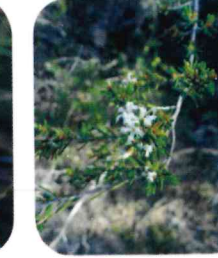
Leucopogon nitidus Hidden Beard Heath Description: Shrub to 1 m high Flowering: Jul-Aug Rank: EN, EN