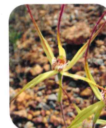
Caladenia elegans Elegant Spider Orchid Description: Orchid 20 to 30 cm high Flowering: Jul-Aug Rank: GR, EN