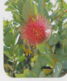
Eucalyptus impensa Eneabba Mallee Description: Straggly mallee to 1.5 m high Flowering: Jun-Jul Rank: CR, EN

Description: Erect heath-like shrub to 1.6 m high Flowering: Jul-Sep Rank: CR