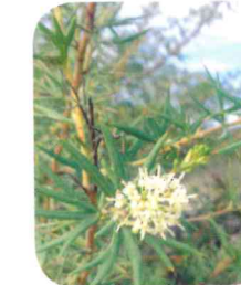
Grevillea phanerophlebia Veined-leaf Grevillea Description: Shrub 0.9 to 1.5 m high. Flowering: Aug-Oct Rank: CR