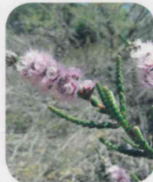
Verticordia spicata subsp. squamosa Scaly-leaved Featherflower Description: Compact shrub to 1 m high Flowering: Nov-Dec Rank: CR, EN