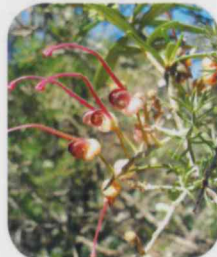
Grevillea batrachoides Mt Lesueur Grevillea

Description: Mallee 1 to 4 m high, bark rough & flaky Flowering: Nov-Dec/Jan Rank: VU, VU