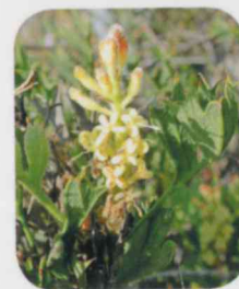
Grevillea althoferorum subsp. althoferorum

Split-leaved Grevillea Description: Low shrub to 0.5m high with spreading branches Flowering: Aug-Oct Rank: CR, EN