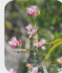
Andersonia gracilis Slender Andersonia

Description: Tree or shrub to 8 m high Flowering: May Rank: EN, EN