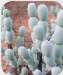
Tecticornia bulbosa Large-articed Samphire Description: Sprawling shrub to 1 m high and 2 to 3 m wide Flowering: Apr Rank: VU, VU