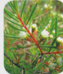
Chamelaucium sp. Cataby Griffin's Wax Flower

Description: Perennial herb to 0.2 m high Flowering: Aug-Sep Rank: VU, VU