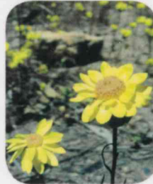
Schoenia filifolia subsp. subulifolia Description: Annual paper daisy to 50 cm high Flowering: Sep-Oct Rank: EN, EN