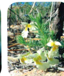
Lechenaultia chlorantha Kalbarri Lechenaultia Description: Shrub to 30 cm high Flowering: Aug-Sep Rank: EN, VU