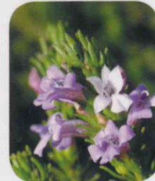
Eremophila scaberula Rough Emu Bush

Description: Low shrub 0.5 to 0.9 m high with spreading branches Flowering: Jul Rank: EN, EN