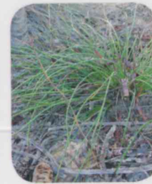
Hensmania chapmanii Chapman's Hensmannia Description: Tufted perennial herb to 0.3 m high Flowering: Dec-Jan Rank: VU, VU