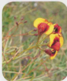
Daviesia bursarioides Three Springs Daviesia Description: Straggling shrub to 2 m high Flowering: Jun-Sep Rank: CR, EN