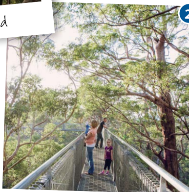
Walk through the tingle canopy