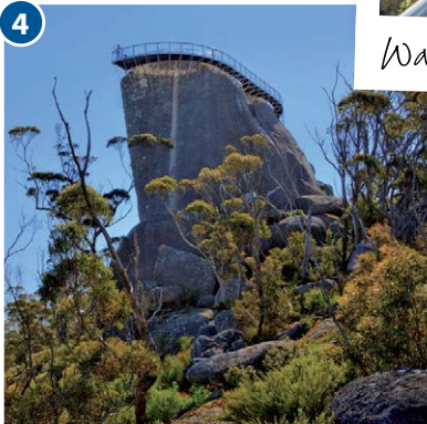
Walk high in the sky