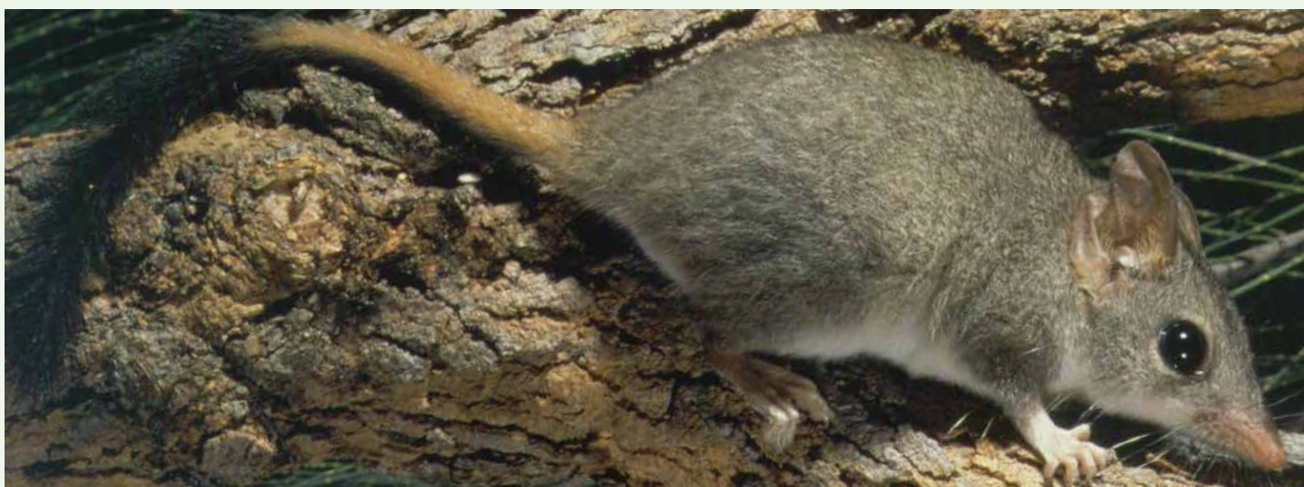
Phascogale: this charismatic small carnivore needs large trees with hollows for shelter from foxes and cats, and enough insects and small vertebrates to fuel its high metabolism.