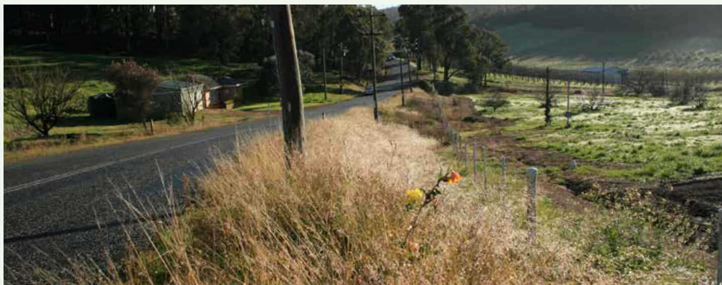
An example of a low conservation value roadside.