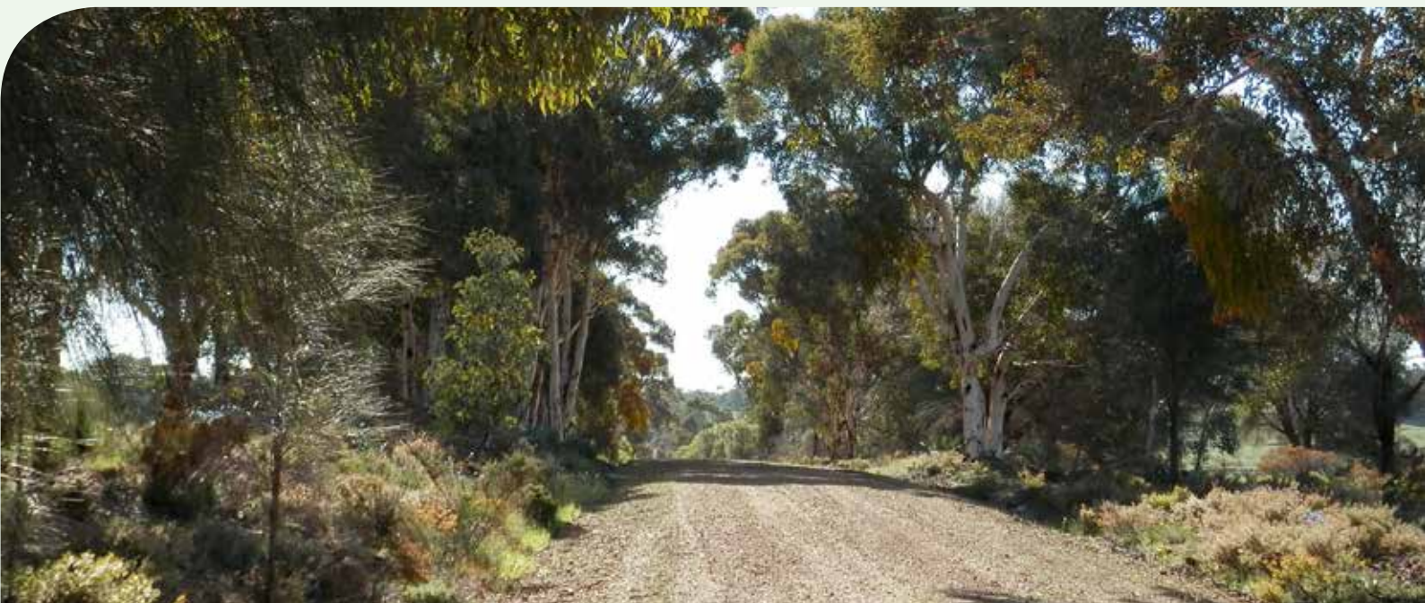
An example of a high conservation value roadside in the State's Wheatbelt.

Identifying areas of different conservation value gives road managers important information to help make planning decisions, enable staff to prioritise areas needing extra care and attention during roadwork operations, identify strategic sites for rehabilitation, and more. The Roadside Conservation Committee offers a free service to map the conservation value of roadsides. This Verge Note contains information on that service and outlines its benefits.