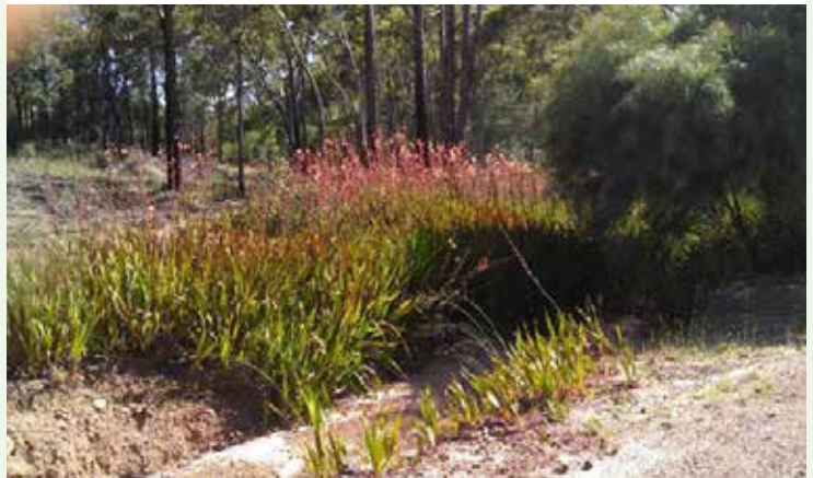
RCV mapping enabled the Shire of Mundaring to target areas of problem weeds like watsonia. Note how the weed became densely established on an area of disturbed ground. If left untreated it would have progressively invaded the neighbouring native vegetation.