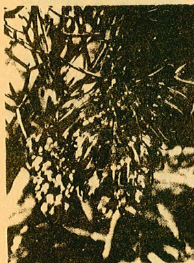
Lamb's Poison · Isotropis cuneifolia · Grevillea dielsiana