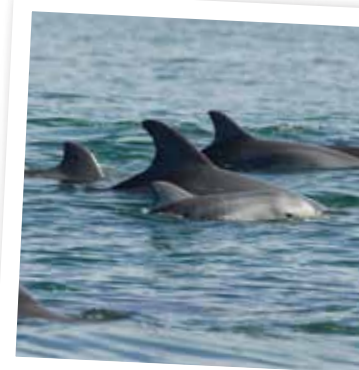
Dolphin Discovery Centre

Bookings and enquiries: dolphindiscovery.com.au