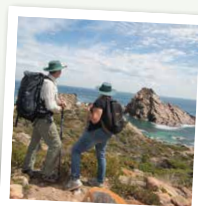
Cape to Cape Track