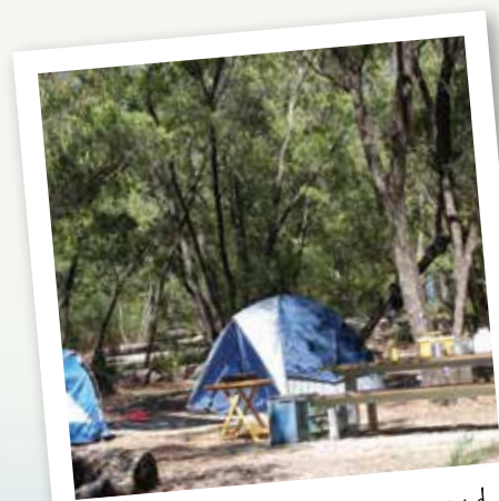
Martins Tank campground