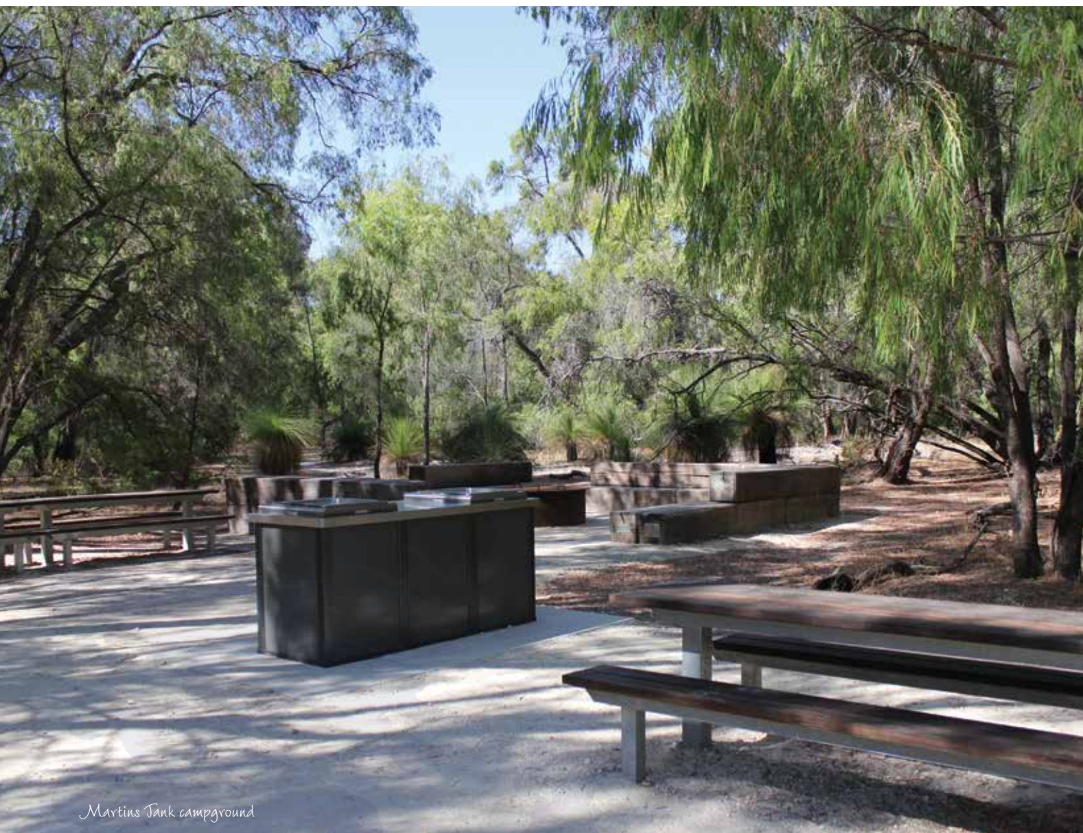
Martins Tank campground