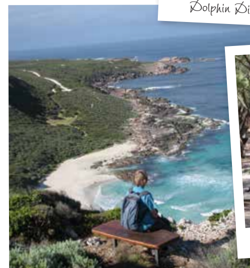
Conto beach, Leeuwin-Naturaliste National Park

Bookings essential: parkstay.dpaw.wa.gov.au