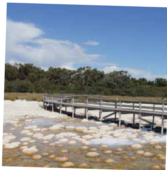
Lake Clifton, Yalgorup National Park

Visit the bird hide on the shores of Lake Pollard and discover how many species of birds visit this special place.