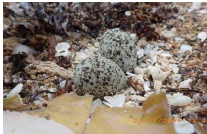
From the top: Loggerhead turtle. Fire remnants left on the island Fairy tern nest. Below: Osprey