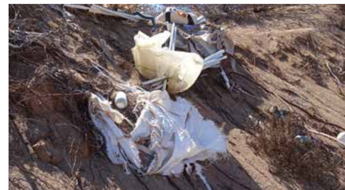
Above: Rubbish left behind on islands. Below: Cultural artefacts on Pilbara Islands.