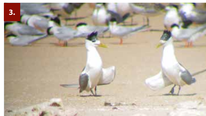
1. Pied oystercatcher chick, North Mangrove Island. 2. White-bellied Sea Eagle nest on Airlie Island 3. Crested terns, Bessieres Island