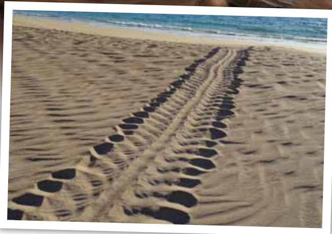
Top: Flatback turtle. Above: Green turtle tracks on Serrurier Island.

Can I take my pet onto an island? Leave your pets at home, or on your vessel. Dogs chase wildlife causing stress, injury and/or death to native animals. Pets can compete for food and resources of native island communities and cause distress to nesting birds and turtles. Pets can also introduce weeds and disease to the reserves.