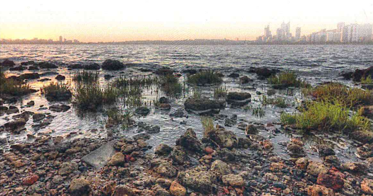
Top River Guardians connects people with the Swan Canning Riverpark. Above The sun setting over the city foreshore.