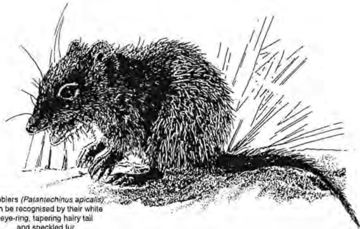
Dibblers ( Paiantechinus apicalis ) can be recognised by their white eye-ring, tapering hairy tail and speckled fur.

Seabirds are present on the islands throughout the year. They are particularly vulnerable in summer when many are courting, nesting and raising their chicks. Wedge-tailed Shearwaters burrow their nests into deep stabilised sands of the foredunes. Bridled Terns are found nesting on and beneath vegetation.