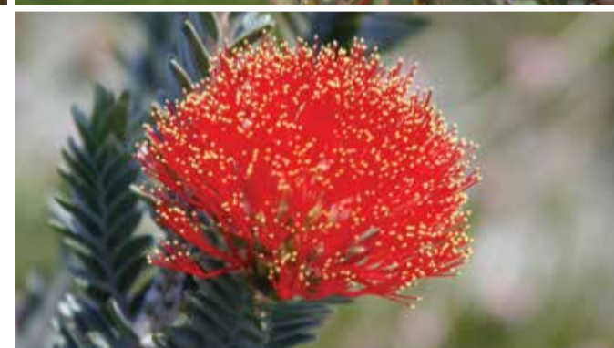
Top Honey possum. Above Barrens regelia ( Regelia velutina ).