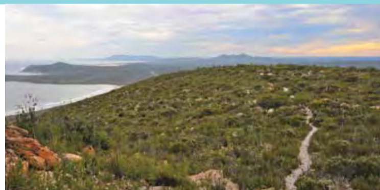
East Mount Barren plateau.