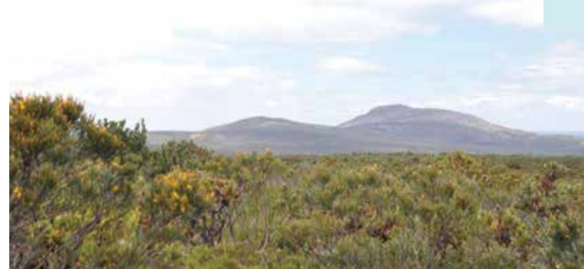
View from Sepulcralis Hill towards East Mount Barren.

plants. Many banksia species can also be seen along the track with descriptive names including creeping banksia ( B. repens ), nodding banksia ( B. nutans ), and violet banksia ( B. violacea ). The banksia genus was named after the naturalist Joseph Banks, who accompanied Captain Cook on his voyage of discovery in 1770.