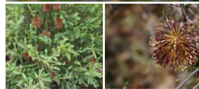
Top Calothamnus validus . Above Banksia nutans . Above right Banksia violacea .