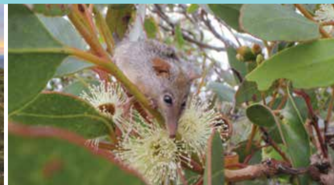
Top Honey possum. Above Barrens regelia ( Regelia velutina ).

Changing sea levels have left a wave cut platform at the seaward base of East Mount Barren, evidence that sea levels over 40 million years ago were more than 100m higher than today. The ancient mountain tops rising above the sea provided island refuges for primitive plants and animals when the peaks were surrounded by water.