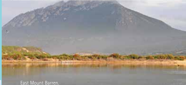
East Mount Barren.

Fitzgerald River National Park is one of the most botanically significant national parks in Australia with about 15 per cent of Western Australia's described plant species found here. There are also more species of animals living here than any other reserve in south-western Australia, so if you love nature, this is the place to be!