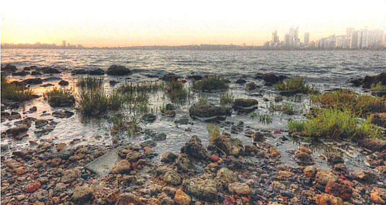
Top River Guardians connects people with the Swan Canning Riverpark. Above The sun setting over the city foreshore.