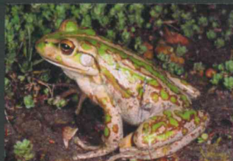
Litoria moorei – motorbike frog