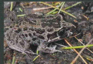
Limnodynastes convexiusculus - marbled frog