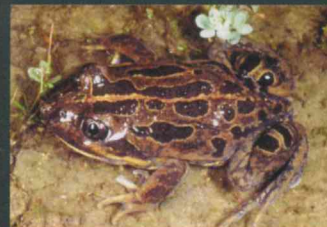
Limnodynastes dorsalis – western banjo frog