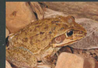
Cyclorana australis - giant frog