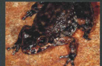
Litoria meiriana - rock hole frog