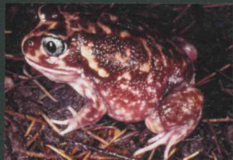
Heleioporus eyrei – moaning frog