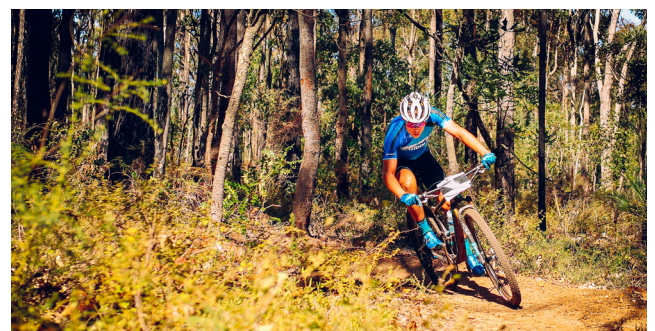
Mountain biking photos courtesy of MTBGuidebook.com

All trails will be designed and built using the Western Australian Mountain Bike Guidelines, coordinated by the Parks and Wildlife Service. The guidelines inform the process and include necessary approvals and checklists for management of flora, fauna, Aboriginal and other heritage considerations and issues such as weeds, pest and dieback. The department's Disturbance Approval System comprehensively assesses any and all values that need to be protected.