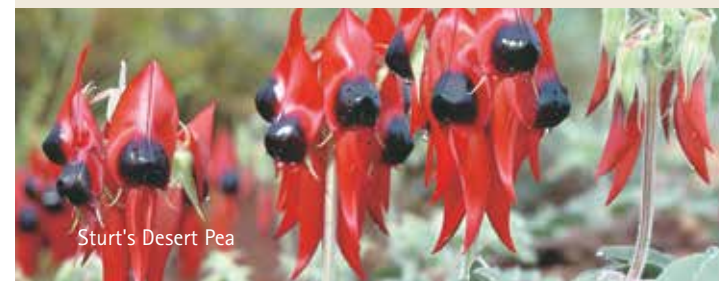
Sturt's Desert Pea

The Millstream area is a priority one catchment and, used in tandem with the Harding Dam, the aquifer supplies water to industry and for domestic use to the people of Wickham, Roebourne, Point Samson, Dampier and Karratha. The water level is constantly monitored and, in times of low water, pumps can be used to keep the Millstream pool topped up and flowing—an essential safeguard for the long-term survival of the wetland and its dependent wildlife.