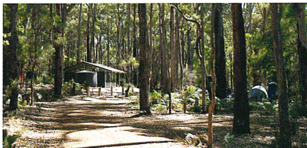
Jarrahdene Campground, Leeuwin-Naturaliste National Park.

For more information visit dbca.wa.gov.au , contact any Parks and Wildlife Service office or phone the information line on (08) 9219 9000.