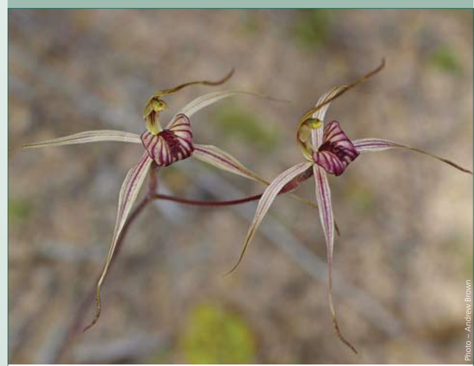
Habitat Sandstone outcrops, the top edges of gorges and open woodland

Description An orchid three to eight centimetres tall Flowering time August to September