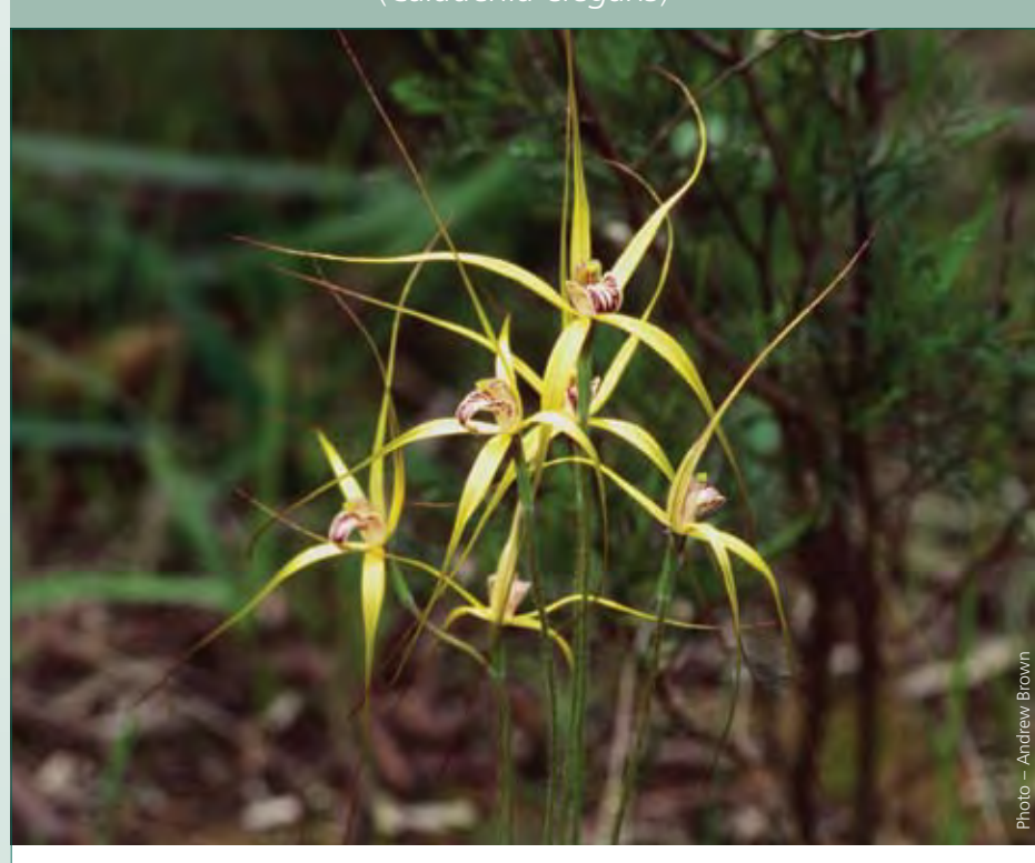
Habitat Winter-wet flats in open areas among dense shrubland Description An orchid 20 to 30 centimetres tall Flowering time Late July to August