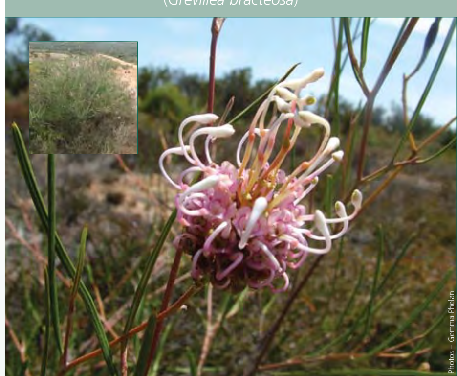
Habitat Among trees or in heathland on gravelly soil or sand Description A shrub 0.5 to two metres tall Flowering time August to October