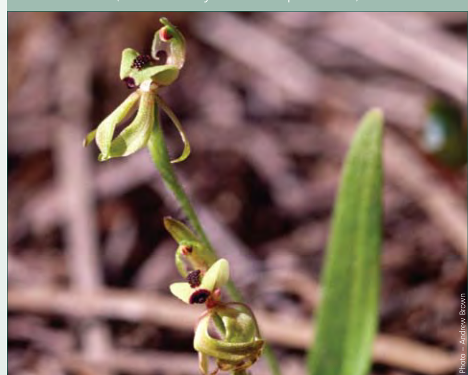
Habitat Low heath on limestone hills or in winter-moist flats Description An orchid three to eight centimetres tall Flowering time August to September