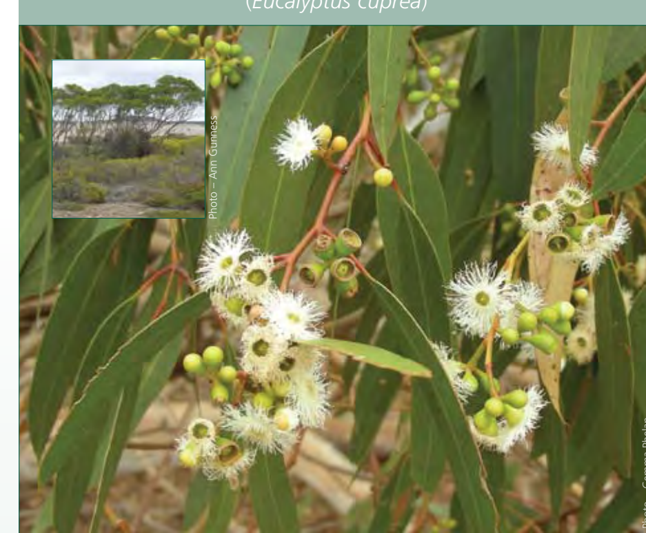
Habitat Loams and clay, emergent over low heath Description A mallee tree 2.5 to five metres tall Flowering time August to November