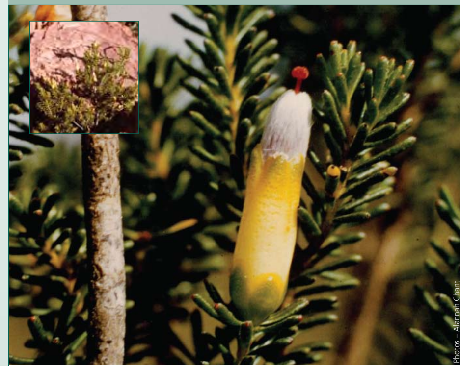
Habitat Low heath in rocky areas and on slopesDescription A shrub 0.3 to one metre tallFlowering time September to October