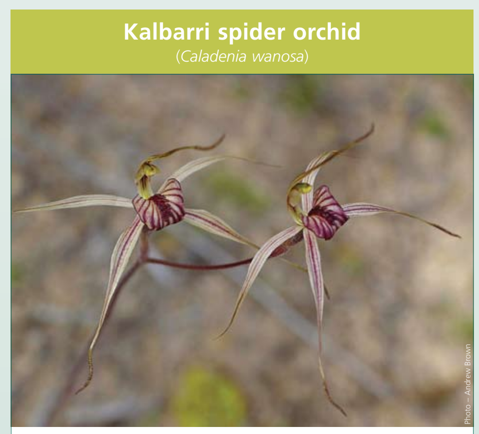
Habitat Sandstone outcrops, the top edges of gorges and open woodlandDescription An orchid three to eight centimetres tallFlowering time August to September