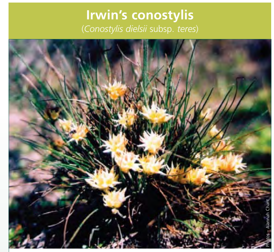
Habitat Heath, scrub and low open woodland Description A herb 13 to 33 centimetres tall Flowering time July to August