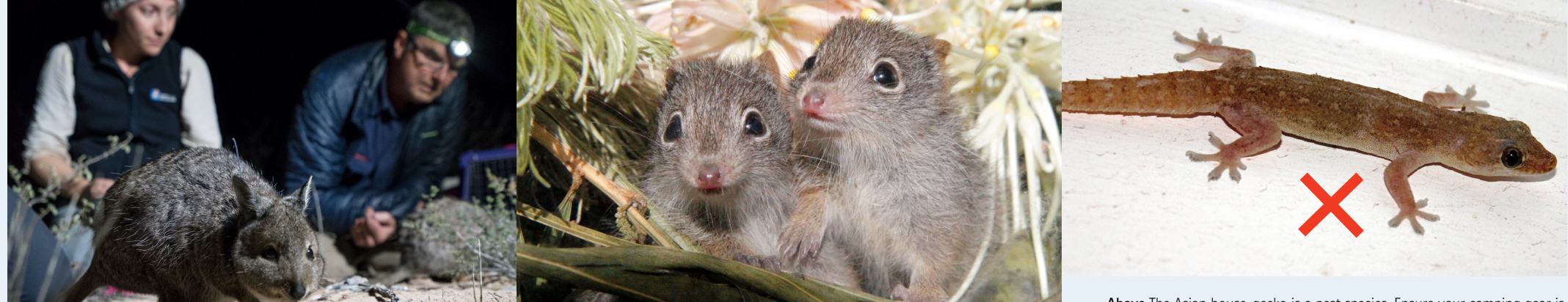
Above DBCA staff releasing a banded hare-wallaby.