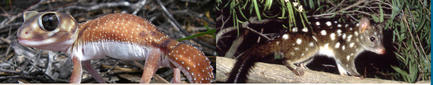
Above A survivor, the knob-tailed gecko is now thriving after the removal of pest species.