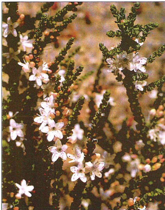
Myoporum cordifolium Jerramungup Myoporum