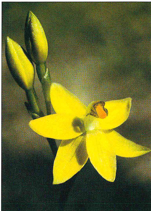
Thelymitra psammophila Sandplain sun orchid