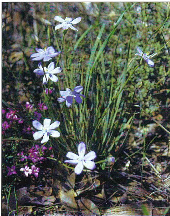
Orthrosanthus muelleri South Stirling Morning Iris