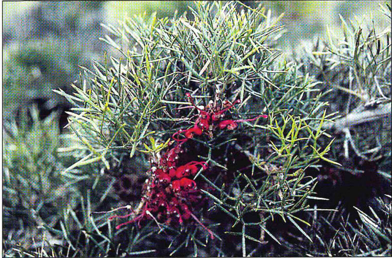
Grevillea maxwellii Maxwell's grevillea