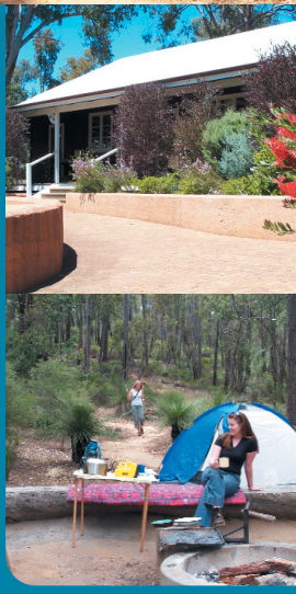
Top: Camping at the Hills Forest Discovery Centre. Above centre: Hills Forest Discovery Centre. Above: Patens Brook campsite.

Check in 2pm; check out 12noon. All facilities have universal access.