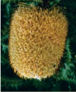
Below left Banksia. Photo - DEC Centre Chuditch. Photo - Bobs and Bert Wells/DEC Right Cockles' tongues. Photo - DEC