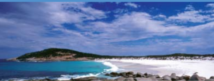
Above Little Tagon Bay, Cape Arid National Park.