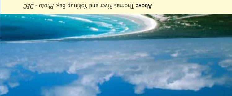
Above Thomas River and Yokinup Bay.

Huge waves and swells can suddenly occur even on calm days. Rocks become slippery when wet. Riptides are common along the coastline.