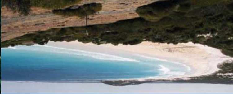
Below Tagon Beach, Cape Arid National Park.

Dieback is a plant disease caused by a waterborne mould known as Phytophthora cinnamomi , which is lethal to hundreds of plant species. Dieback kills plants by destroying their root systems, and places many of the park's plant species at risk. The climate of the south coast favours the spread of dieback, which thrives in wet soil and can easily be spread in mud or soil that adheres to vehicle tyres or bushwalkers' footwear. Because of this, it is sometimes necessary to close roads and tracks or temporarily restrict access to certain areas. To avoid spreading dieback when driving in the park, it is essential to keep to established roads and tracks and obey all 'ROAD CLOSED' signs. Bushwalkers can help by cleaning mud and soil from their boots before entering a park or reserve. By washing the tyres and underbody of your car before and after a trip to a park or reserve, you can help preserve WA's natural areas.