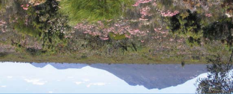
Below Mount Ragged, Cape Arid National Park.