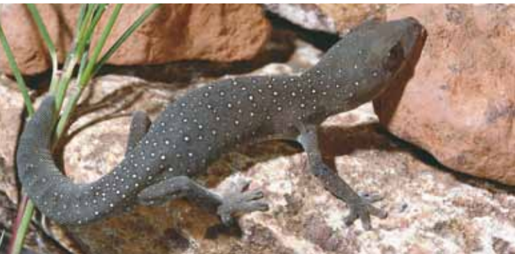
Below Jewelled gecko.

Millstream Chichester National Park offers a variety of walk trails that are classified according to their degree of difficulty and the level of fitness required. Please choose your trails carefully. Select those that suit your level of ability and fitness. Your safety is our concern, but your responsibility.