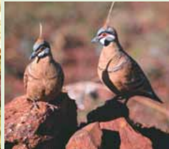
Top Pilbara emerald dragonfly. Above Spinifex pigeons. Right Millstream palms.