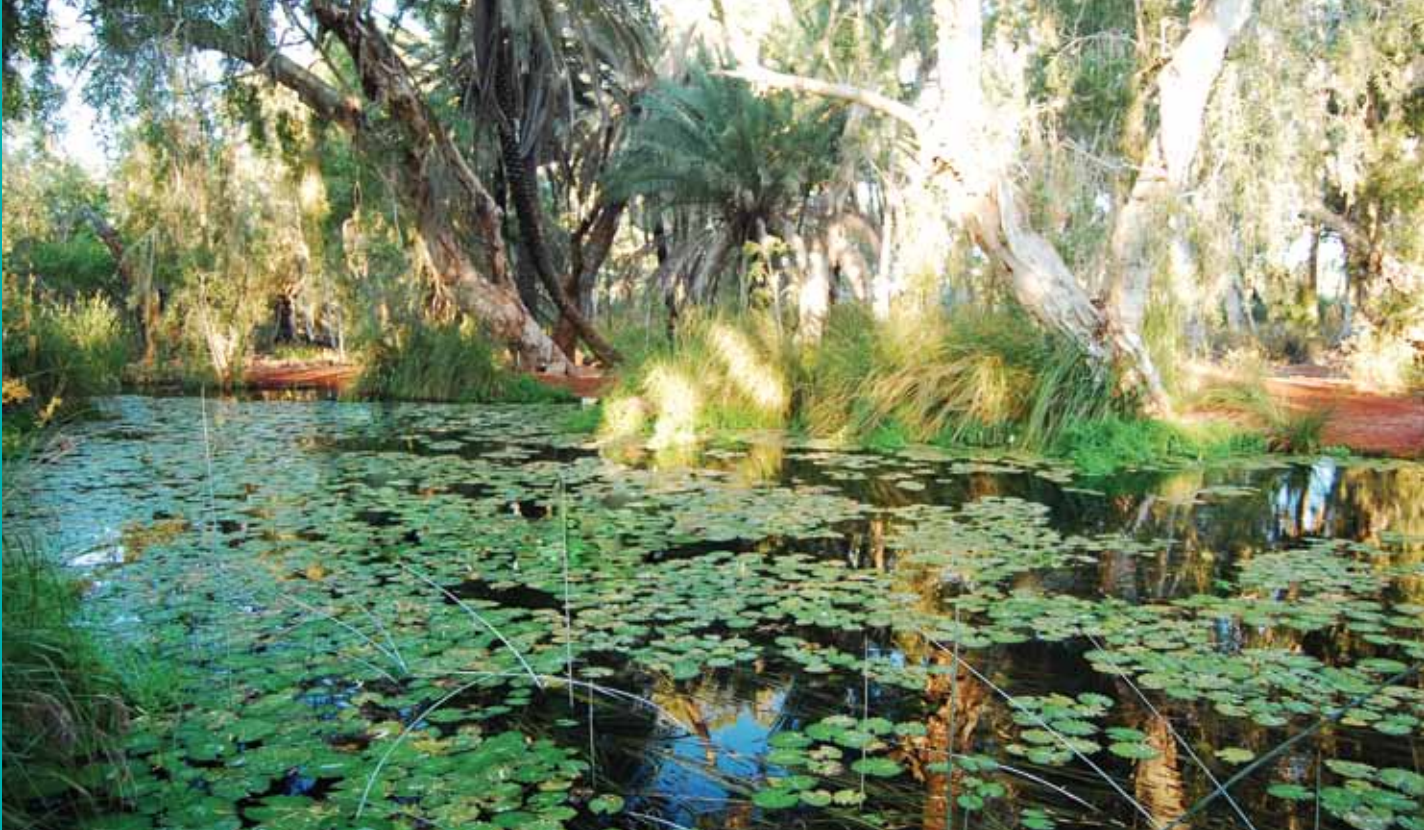
Above Jirndawurrunha Pool.