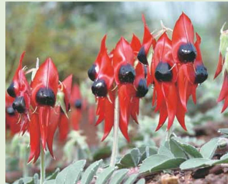
Below Sturt desert pea.

The Pilbara is classified as the arid tropics. During the summer, between October and April, temperatures rise above 40 degrees Celsius and cyclones and local thunderstorms can flood roads and watercourses. The cool season, between May and August, experiences little rain, with daytime temperatures around 26 degrees Celsius. Nights at this time of year can be cool, so don't forget to bring warm clothes.