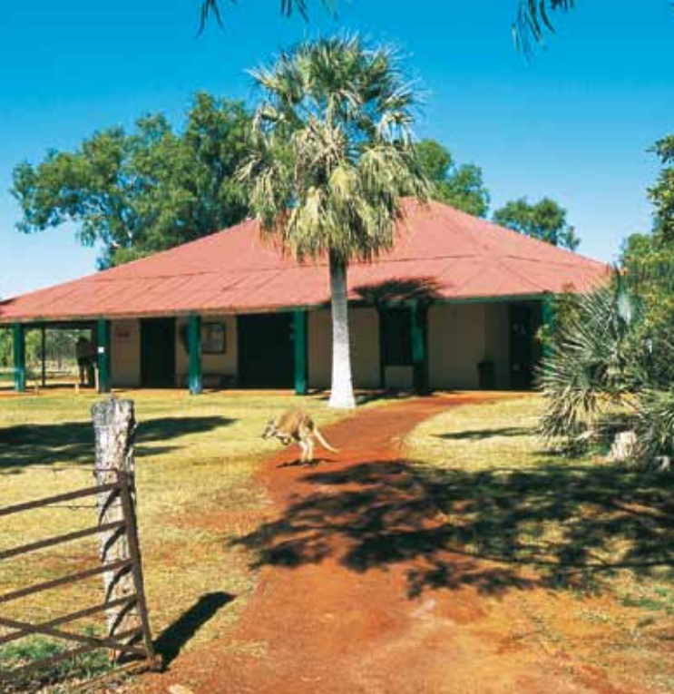
Above Millstream Homestead.