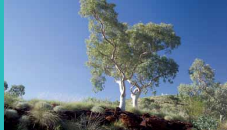
Above Snappy gums.