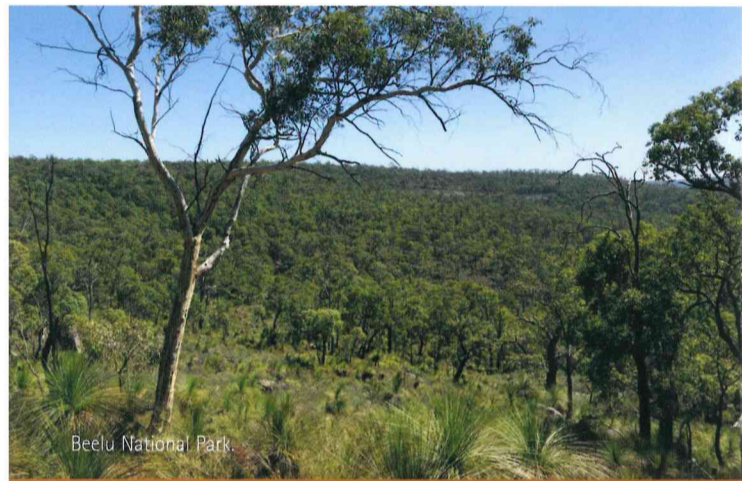
Beelu National Park.