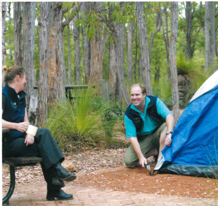
Above Camping at the Perth Hills Discovery Centre.

Tent camping is available at the Perth Hills Discovery Centre. Bookings are essential and can be made online at exploreparcs.dbca.wa.gov.au