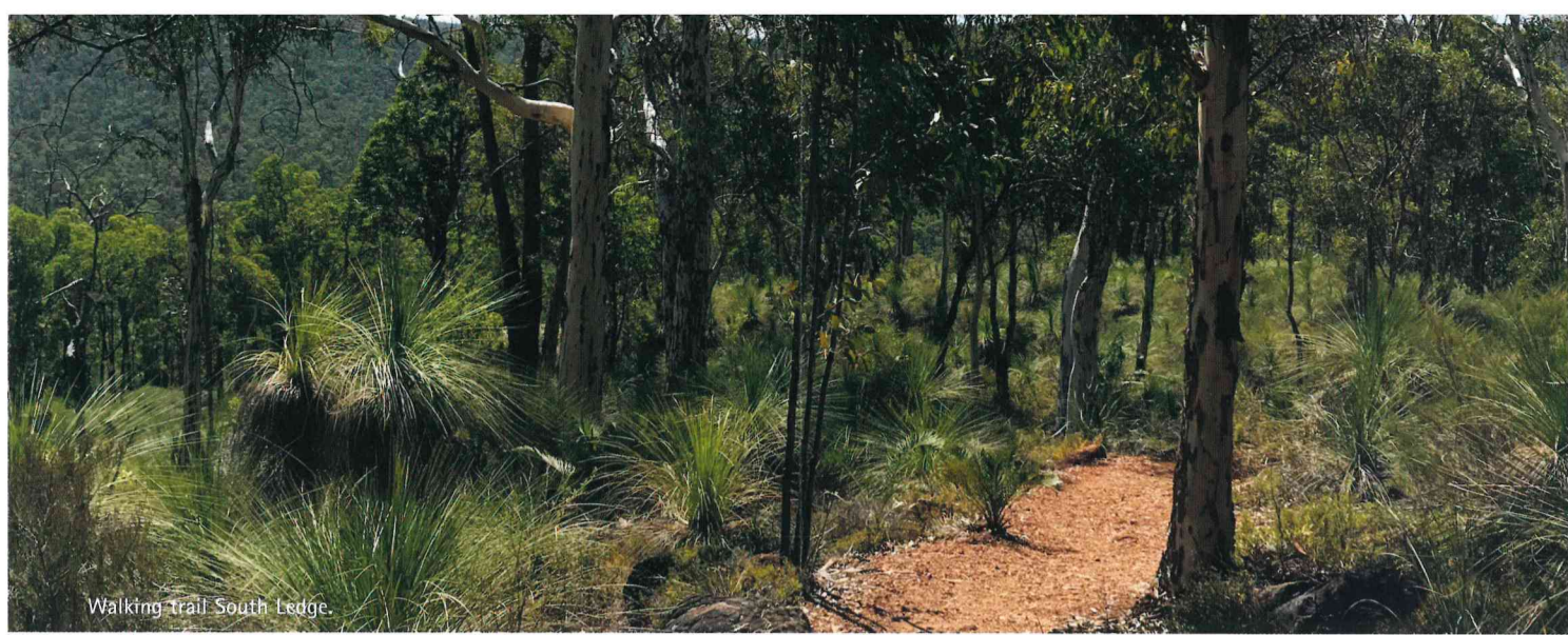
Walking trail South Ledge.

Perth Hills Discovery Centre to South Ledge – 9km return, allow 3-4 hours