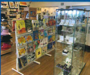
Pinnacles Desert Gallery and Gift Shop

Visit the Pinnacles Gallery to find out more about the formation of the pinnacles.