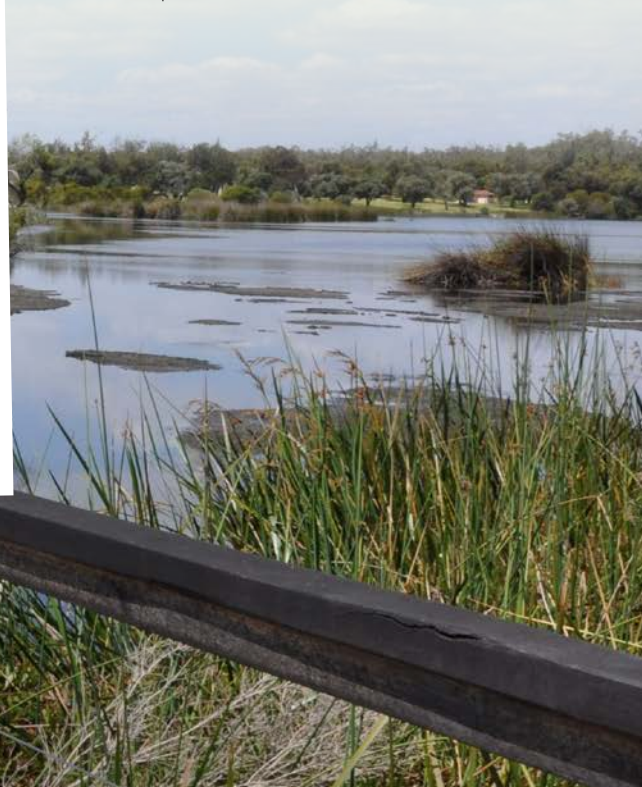
Inset Yanchep volunteers.