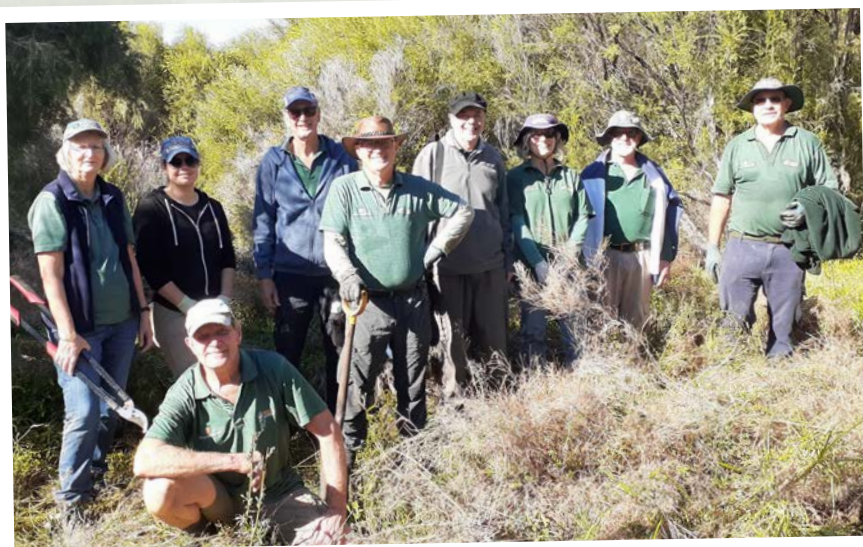
Below Yanchep National Park.

The group plans to implement a long-term weed management program targeting declared pest species Noogoora burr, and other local high priority weeds, by using chemical and manual methods. The group will also continue to nurture partnerships with local schools to educate local children about environmental issues and give them ownership and pride in their local national park.