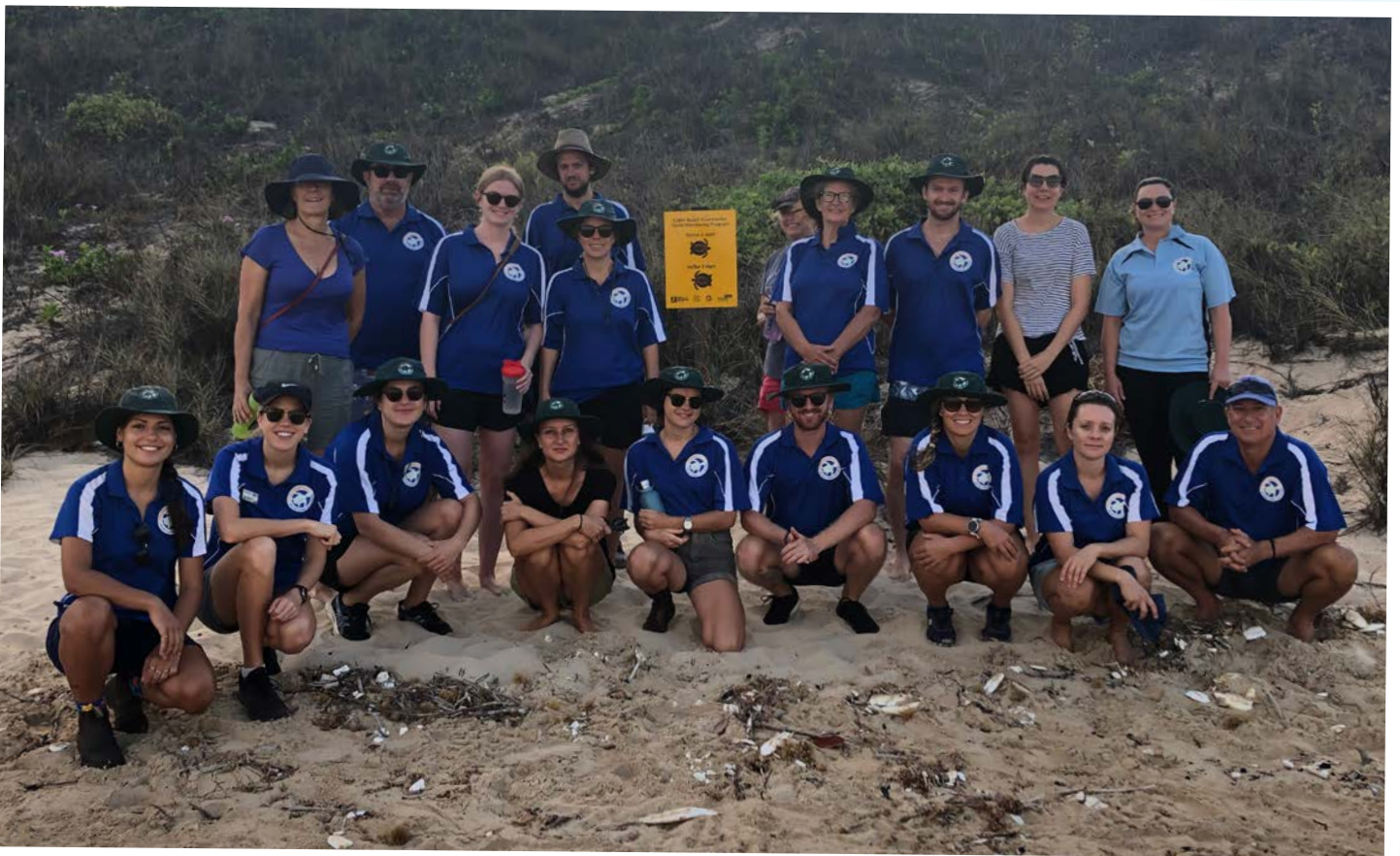
Above Cable Beach Community Turtle Monitoring volunteers.

To prevent disturbance to nesting and hatching turtles, the Yawuru Park Council Working Group are completing a comprehensive review on the current vehicle arrangements on Cable Beach during nesting season. It is anticipated that this will reduce the number of vehicles on the beach during this time.