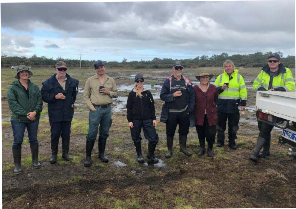
Above Lake McLarty Sedge planters.

A key challenge for Lake McLarty is decreased water levels. The group plans to continue working with partners to explore ways to get additional water into the lake to better prepare the migratory wading birds for the flight to their breeding grounds in the far Northern Hemisphere.