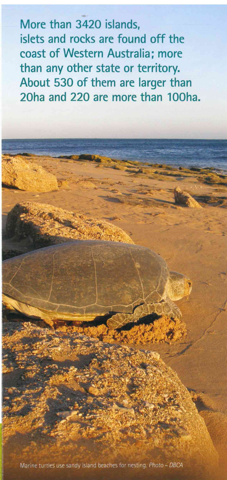
Marine turtles use sandy island beaches for nesting.

More than 3420 islands, islets and rocks are found off the coast of Western Australia; more than any other state or territory. About 530 of them are larger than 20ha and 220 are more than 100ha.