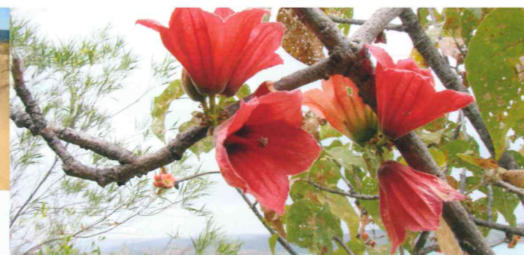
Above Brachychiton viscidulus.