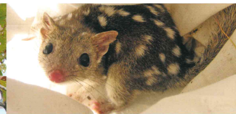
Above The northern quoll has declined in much of its mainland range due largely to the spread of the toxic cane toad.