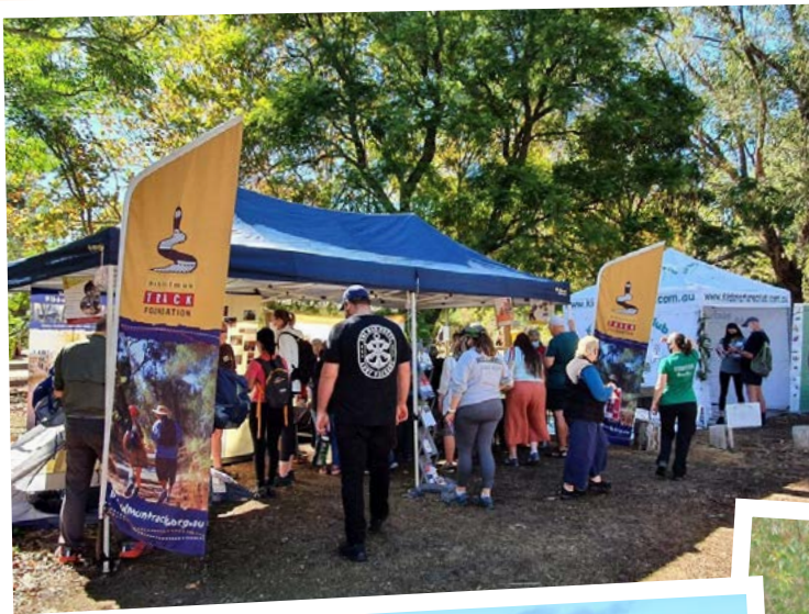
Below left Volunteers repair water bars near William Bay.