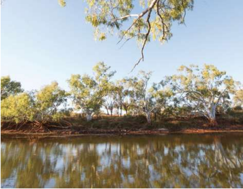
Above Cattle Pool.