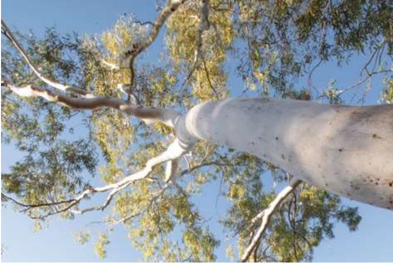
Above Cattle Pool.