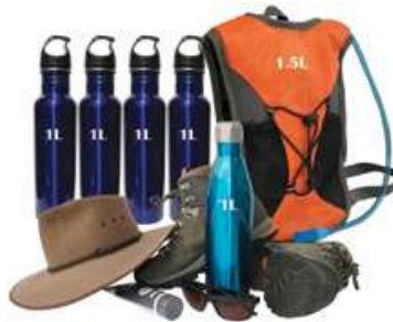
1 litre per person, per hour