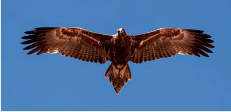
Above Wedge-tailed eagle.