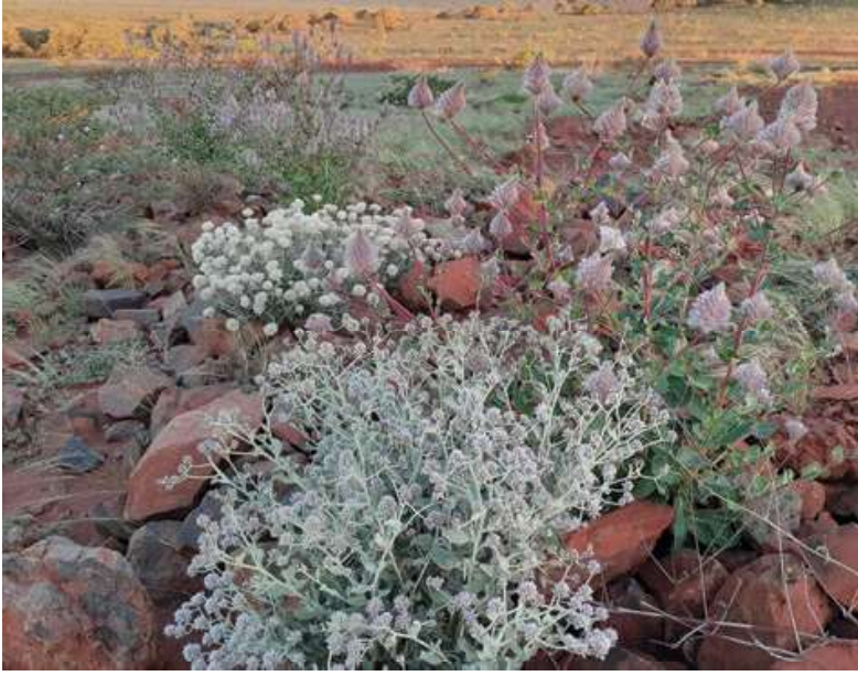
Front cover Mount Augustus National Park. Above Above Wildflowers in the cooler months can be prolific.