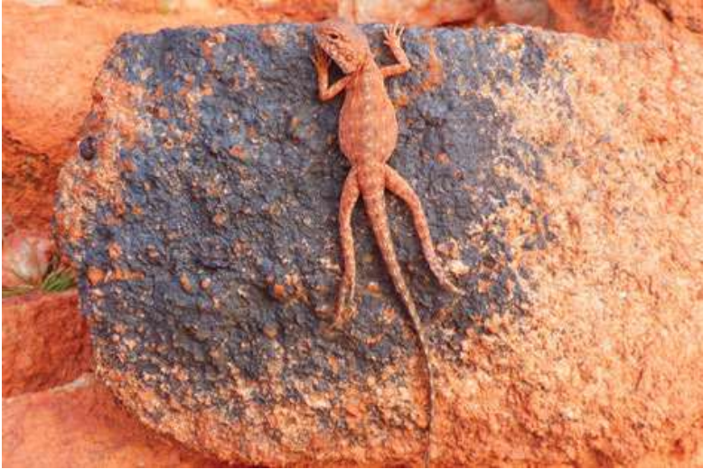
Above The ring-tailed dragon ( Ctenophorus caudicinctus ) commonly occurs on rocky outcrops.