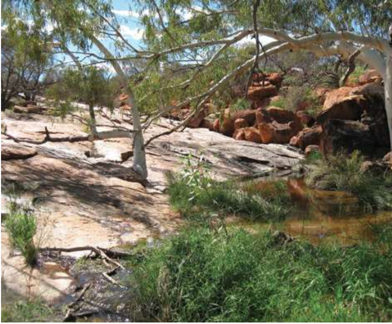
Above Edney's Spring.