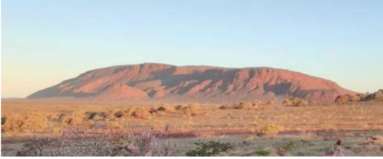
Above Geological giant – Mt Augustus in the late afternoon.