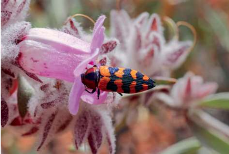
Above Mount Augustus foxglove and jewel beetle.