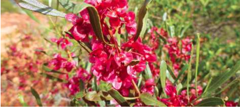
Above The seed pods of the sticky hop-bush ( Dodonaea viscosa subsp. spatulata ) add a splash of colour to your hike.