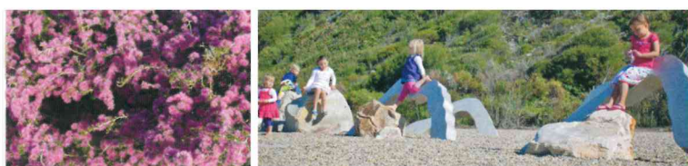
Above left Melaleuca papillosa . Above Barrens Beach.