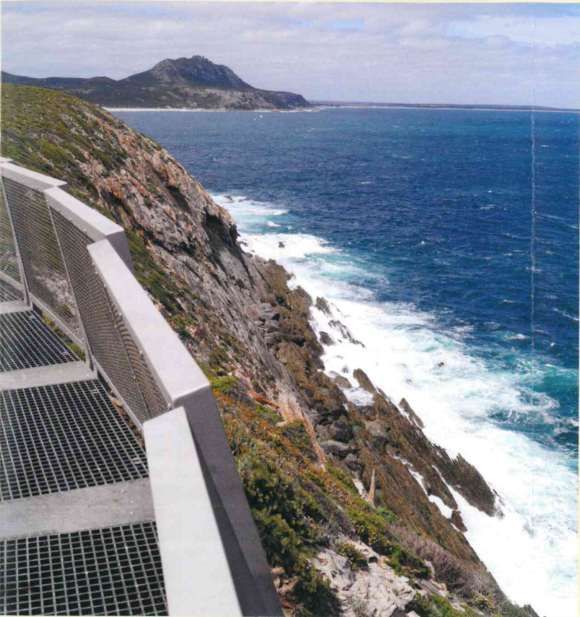
Above Walkway at Cave Point. Right Mylies Cove

Please refer to the Mamang Walk Trail brochure for a full explanation of all the walk options for this trail.