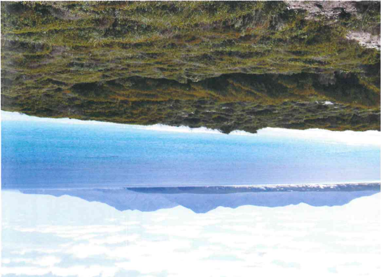
Above Point Charles Bay.

More species of animals live in this national park than in any other reserve in south-western Australia. They include 22 mammal species, 41 reptile species and 12 frog species. The park also has more than 200 bird species including rare species such as the western ground parrot, the western bristle bird and the western whiplbird. In recognition of the importance of protecting and conserving the region's unique flora and fauna, the central area of the park is a wilderness management zone, and is not accessible by vehicles.