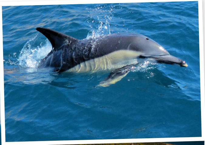
Below Common dolphin.

More information about Commonwealth Marine Parks can be found at parksaustralia.gov.au/marine/