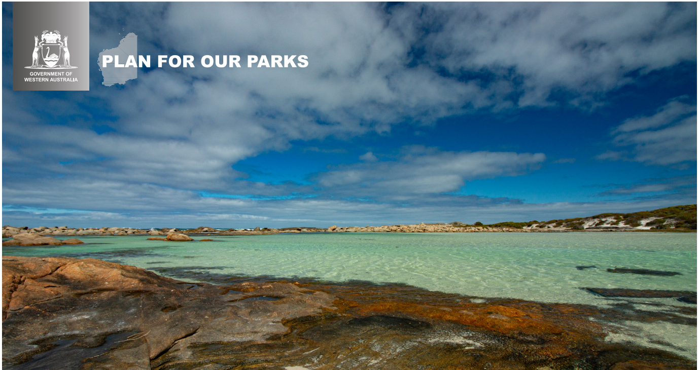
Waters off Cape Arid.