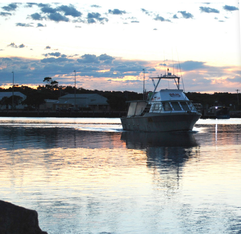
Below and inset Fishing off the coast of Esperance.

The proposed south coast marine park will be carefully designed to minimise impacts to commercial fishers and incorporate any existing restrictions into management arrangements where possible. For example, current