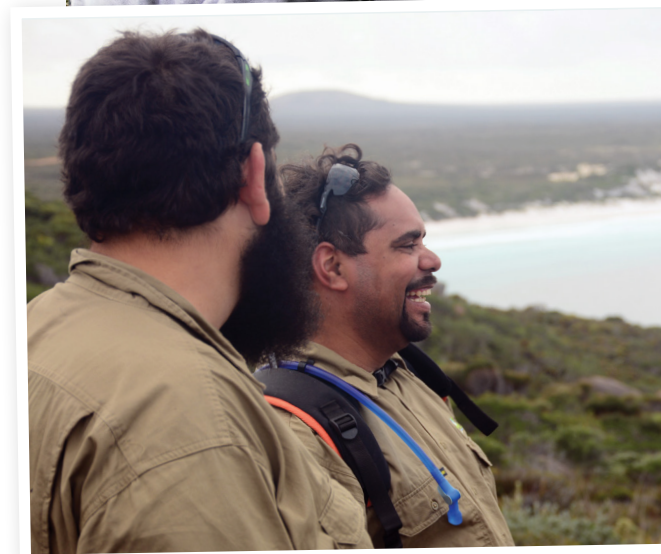
Left Members of the Esperance Tjaltjraak Native Title Aboriginal Corporation.