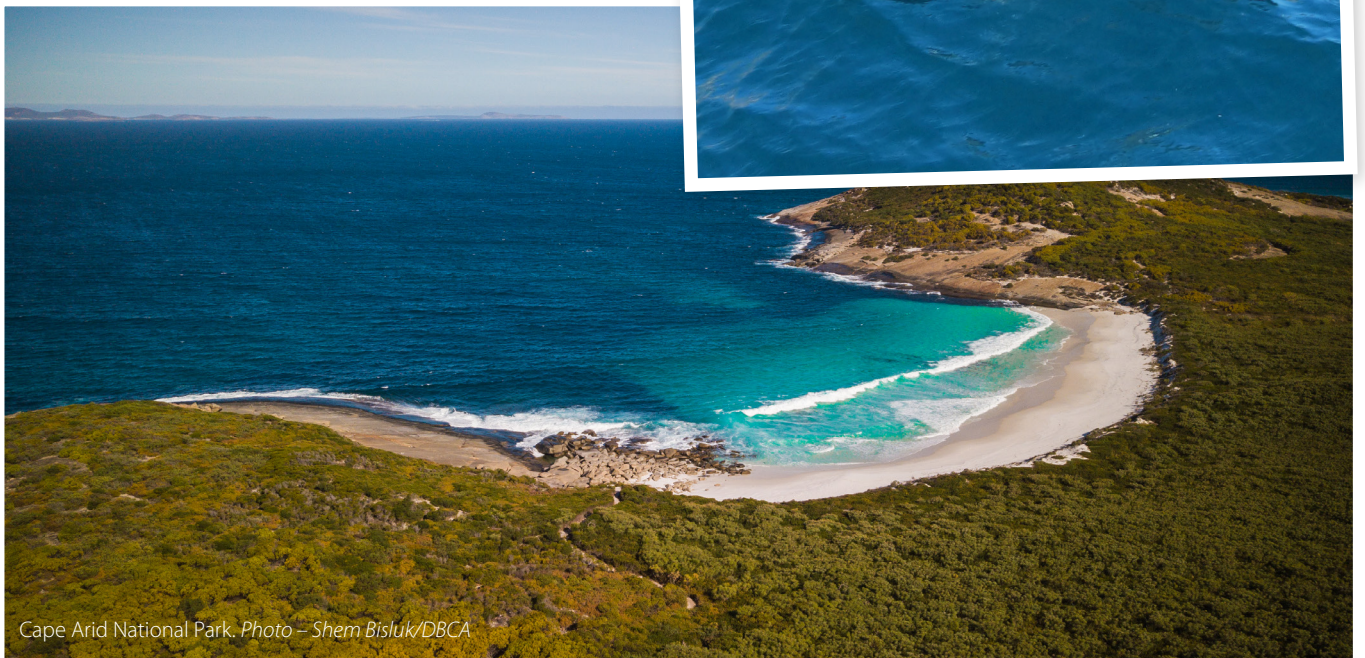
Cape Arid National Park.