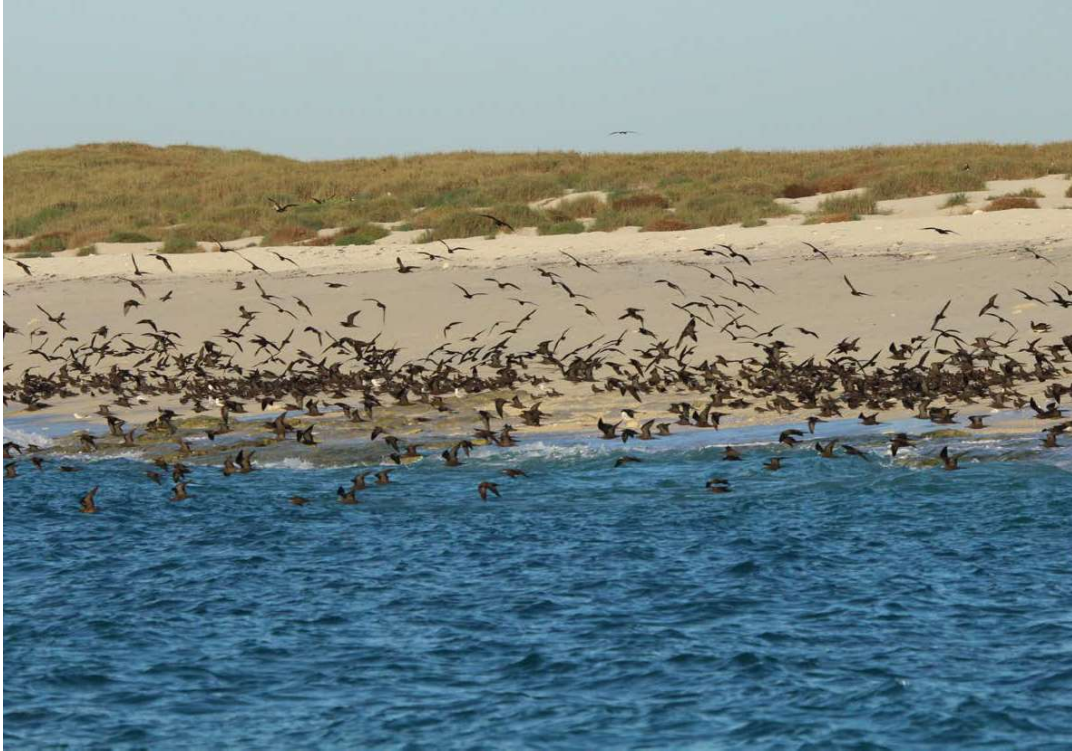
Above Colony of Common noddies.