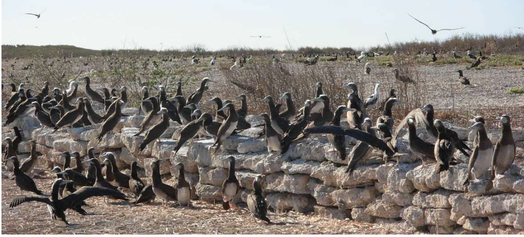
Above Guano mining remains.