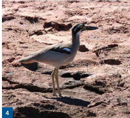
Below 1 Brown booby fledgeling. 2 Green turtle. 3 Flatback turtle tracks. 4 Eastern Curlew.