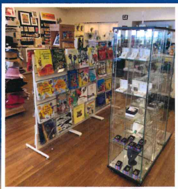
Pinnacles Desert Gallery and Gift Shop

Visit the Pinnacles Gallery to find out more about the formation of the pinnacles.