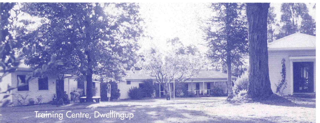
Training Centre, Dwellingup