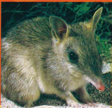
Western barred bandicoot

Discover some of Western Australia's threatened mammals in a unique wildlife tourism experience.