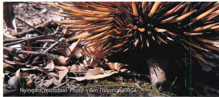
Nyingarn (echidna).

Noongar people are acknowledged as the traditional owners of the lands through which these trails pass. Noongar people have a deep spiritual, emotional, social and physical connection to Boodja (country). Noongar people ask you to please respect Boodja when you walk these trails to ensure its natural and cultural values are conserved for present and future generations.